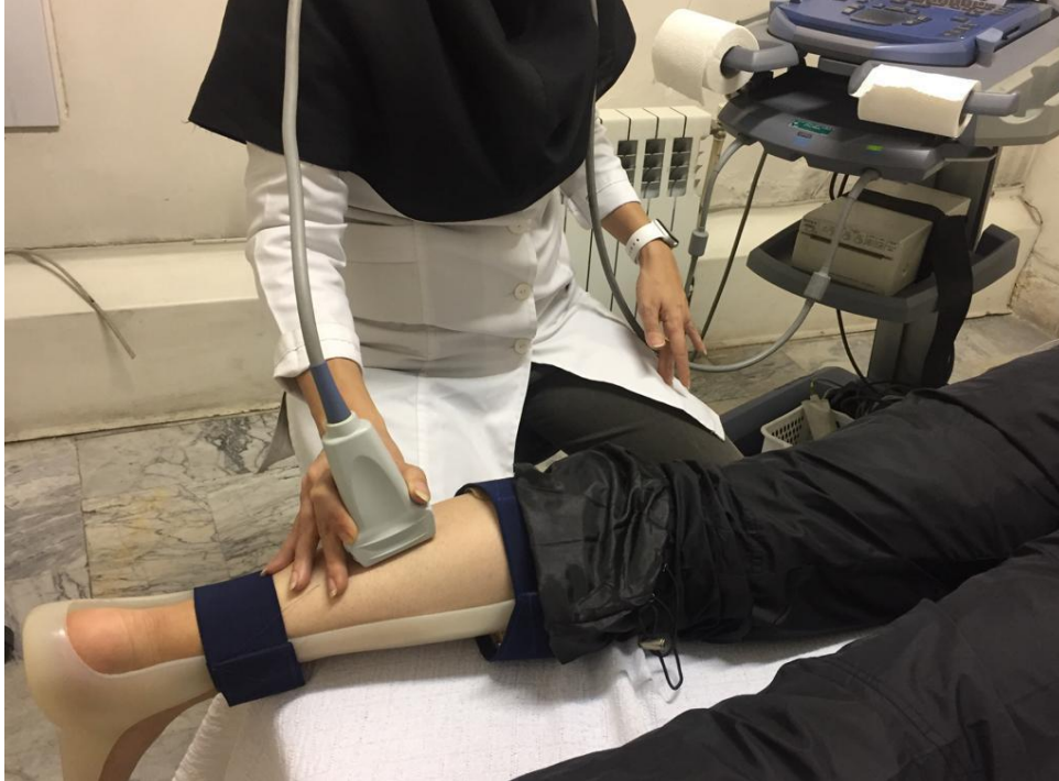
Figure1. Ultrasonographic gastrocnemius muscle measurements