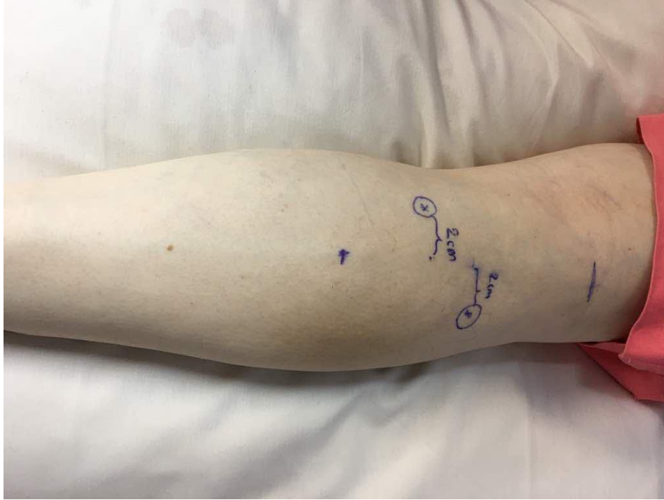
Figure 3. Locations for dry needling