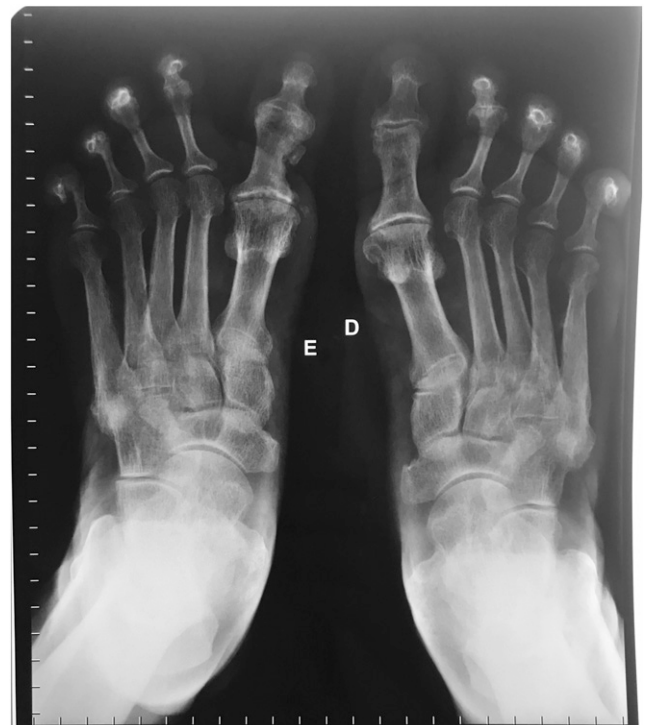
FIGURE 5. Reduction of the metatarsophalangeal joint space of the bilateral hallux and interphalangeal joint, marginal osteophytosis, and subchondral cysts.

Leprosy-related arthritis can be divided into the following groups: 1) neuropathic arthropathy or Charcot’s joints, 2) septic arthritis, 3) acute polyarthritis of the leprosy reaction, and 4) chronic arthritis. 8 Arthritis in leprosy reactions presents acutely, being a symmetrical inflammatory polyarthritis that affects small joints of the hands and feet, similar to RA. 8