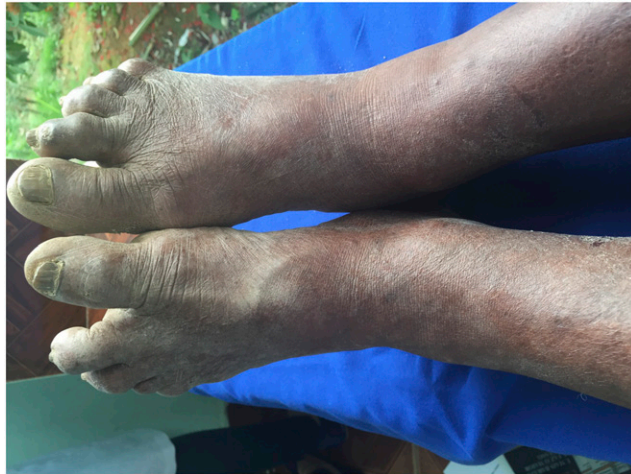
FIGURE 2. Feet: joint deformities mimicking rheumatoid arthritis (“hammer toes”). This figure appears in color at www.ajtmh.org .

Radiography of the hands showed reduction of the metacarpophalangeal joint spaces of the second and third bilateral fingers and reduction of the interphalangeal joint spaces from the second to the fifth finger associated with subchondral sclerosis. This was more pronounced in the proximal interphalangeal joints, where deformity with marginal osteophytosis, sparse subchondral cysts, and subluxation was observed with ulnar deviation from the second to the fifth bilateral finger (Figure 3). In the right hand, a “boutonnière” deformity in the fifth finger and a “swan neck” in the third finger were observed. In the left hand, a “swan neck” deformity from the third to the fifth finger and a “mallet finger” deformity of the second bilateral finger were observed (Figure 4).