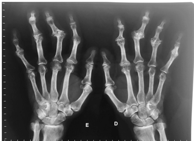
FIGURE 3. Reduction of metacarpophalangeal and interphalangeal joint spaces. Marginal osteophytosis, sparse subchondral cysts, and subluxation in the proximal interphalangeal joints.

Radiography of the feet showed reduction of the metatarsophalangeal joint space of the bilateral hallux and interphalangeal joint associated with subchondral sclerosis of the articular surfaces, marginal osteophytosis, and subchondral cysts (Figure 5). Medial phalangeal flexion and hyperextension of the distal phalanges, most evident in the