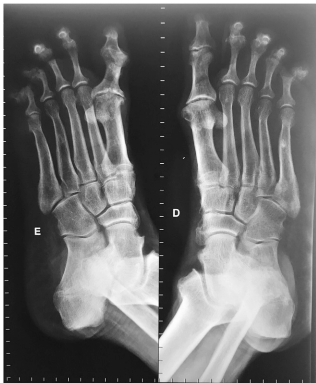
FIGURE 6. Medial phalangeal flexion and hyperextension of the distal phalanges, more evident in the fourth and fifth toes ("boutonnière finger" deformity).

Chronic arthritis not associated with leprosy reactions is a symmetrical polyarthritis, similar to RA of prolonged duration. 8