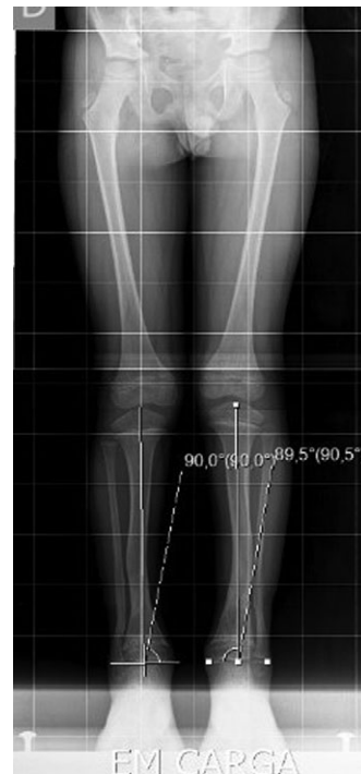
Figure 7: The Rx 1 year after the surgery.

The surgery was uneventful, after 6 weeks there was possible to observe healing of the osteotomy site so the cast and K-wires were removed.