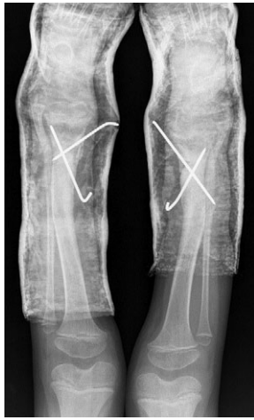
Figure 3: Posoperative Rx.