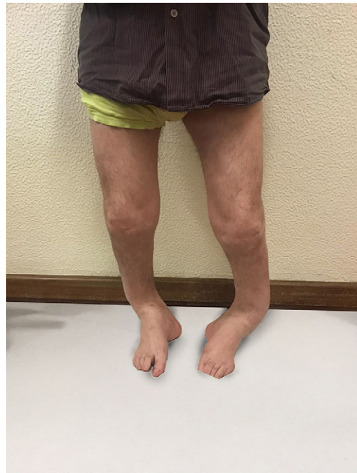
Figure 1: Lower limbs of his father.

The children underwent a series of investigations, including complete blood cell counts, urine biochemistry, alkaline phosphatase and renal function parameters and tests, aimed at investigating calcium, phosphorus and vitamin D metabolism. However, all tests were normal. Hormonal investigations included thyroid hormones, adrenocorticotropic hormone and