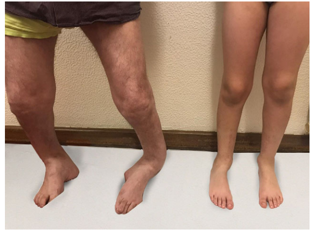
Figure 6: One year after the surgery - the comparison between the father and the child.