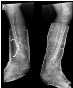
Figure 4: Posoperative Rx.