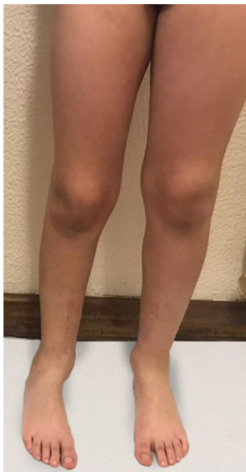
Figure 5: One year after the surgery.