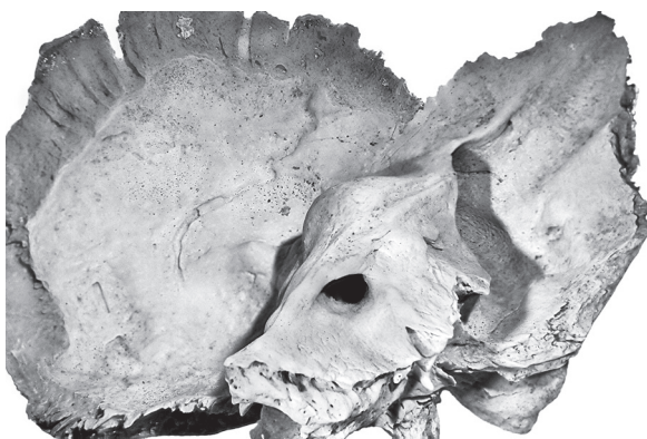
Figure 2. Composite deep focus image of the temporal bone, assembled from 4 separate images presented in Figure 1. Note that all areas of the image are sharp.

se in one image the spatial organisation of the observed anatomical structures. Unfortunately, one of the main problems in optical imaging is the limited depth of focus. This is an essential obstacle to acquire, in focus, in a single image plane, objects that are located at different distances [7]. The solution to this problem seems to be focus stacking, which enhances virtually depth of field. This technique has been used in microscope systems, and has become particularly beneficial in imaging thick objects. Using the extended depth of focus technology may increase by six to eight times the depth of focus of standard systems [1].