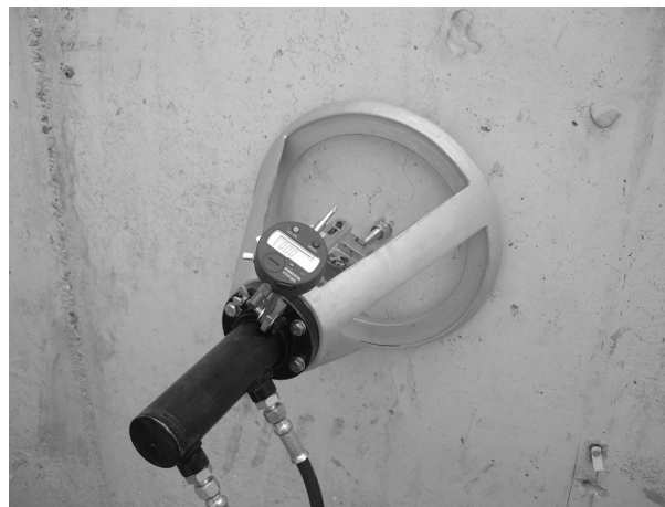
Figure 2. Test pullout (anchorage-resistant element).

In situ tests were carried out by pullout tests anchorage-resistant element, using a pressure plunger and an hydraulic pump (Enerpac) applied to the anchorage tested.