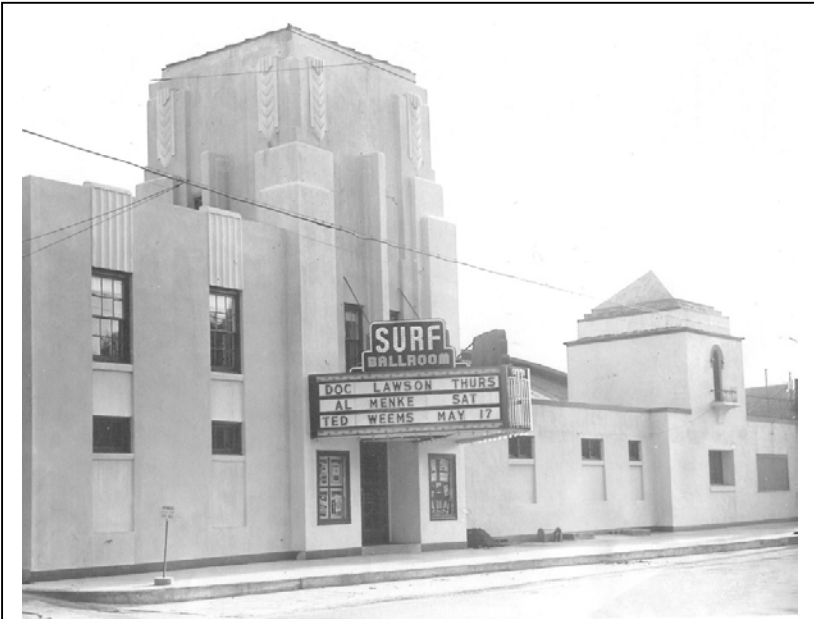
The Surf Ballroom's Art Deco style architecture reflected the trend toward the new and modern in contrast to the Victorian-style dance halls of the early twentieth century.

8,000 square feet, accommodating 500 couples easily," and was made entirely of maple, "laid in such a way that the dancers will always be going with the grain of the wood." The Surf also featured state-of-the-art ventilation and heating innovations for its time. It opened in April 1933 with Wally Erickson's Marigold Orchestra of Minneapolis entertaining the opening night crowd. 9