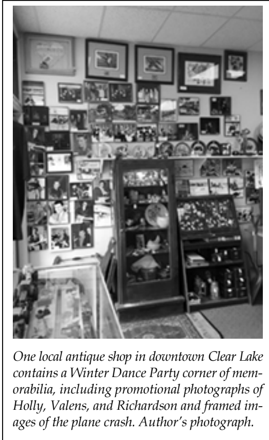
One local antique shop in downtown Clear Lake contains a Winter Dance Party corner of memorabilia, including promotional photographs of Holly, Valens, and Richardson and framed images of the plane crash.

In the immediate aftermath, Clear Lake, and northern Iowa more broadly, moved on relatively quickly. On February 4, the Globe-Gazette noted that these “Dead Rock ‘n’ Roll Stars Had Many Fans” in Mason City, and the reporter interviewed several record-store owners in town to verify that claim. 51 Most press coverage at the time noted that the entertainers were young and that they were “all on the way up as singers.” Holly had the most established career, having toured in England for 25 days in 1958. Several years later, the Beatles discussed Holly’s influence on their band’s style and musical sound.