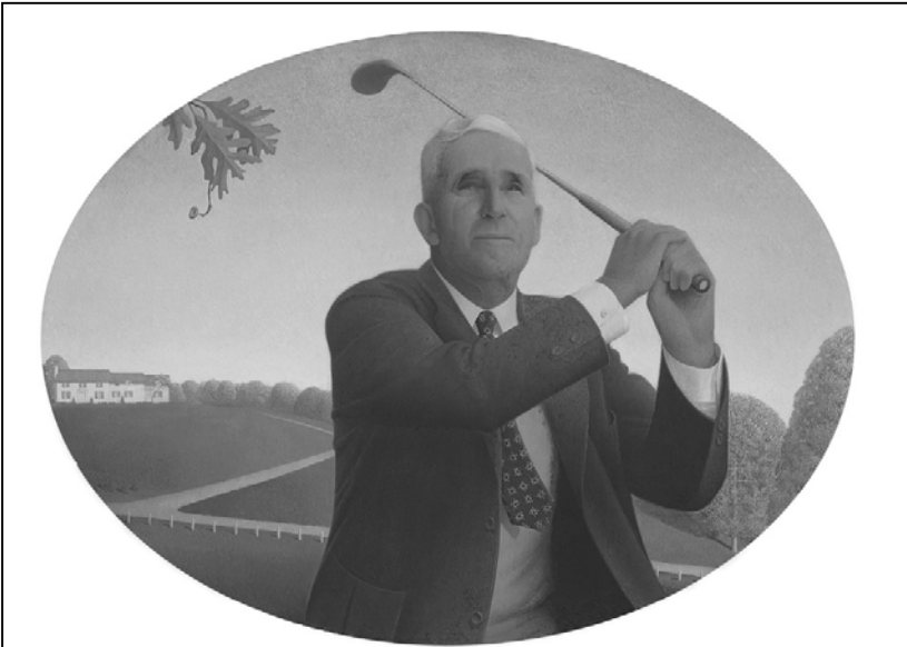
Grant Wood, The American Golfer, 1940. Oil on board, 36½" x 48". Courtesy Crystal Bridges Museum of American Art, Bentonville, Arkansas, 2014.33.