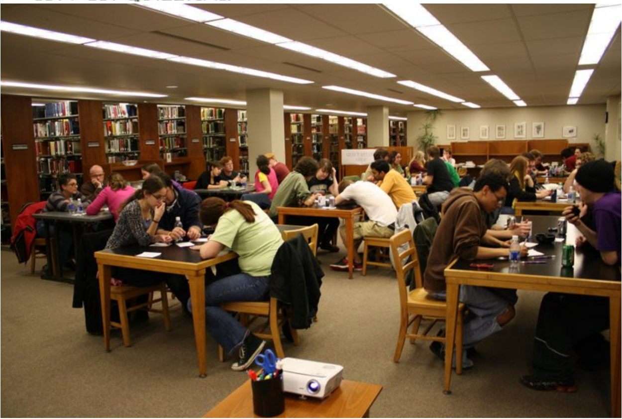
Teams working out the answers to a trivia question on the Quiet Study Floor of the library (between class sessions.)