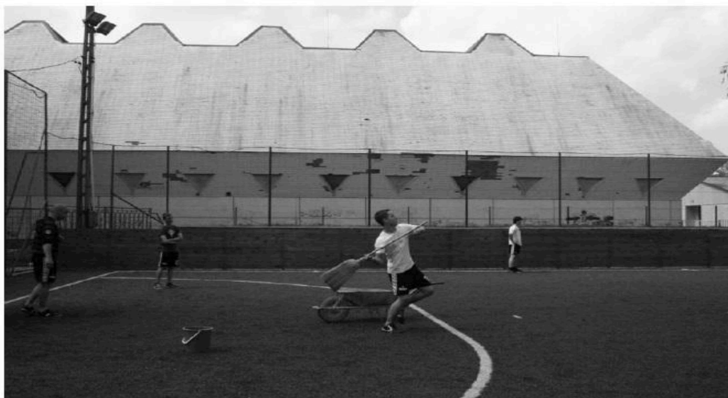
Figure 1. Broom throwing – “peasant javelin”