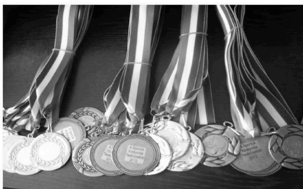
Figure 5. Medals from the host competition "Athletics sports at close quarters" From teacher Horvath's project, 2012

The valuation which maintains the motivation for learning and ensures the right self-esteem in the same time is not an easy, but a necessary task in any subject. As of the PE culture, the matter of assessment and benchmarking is transmissibly complex (we evaluate the absolute performance, the performance compared to themselves, the attitude), and becomes even more complicated by the projects values based on voluntary undertaking, differentiated individual or group work nevertheless are also aspiring for improving the performance.