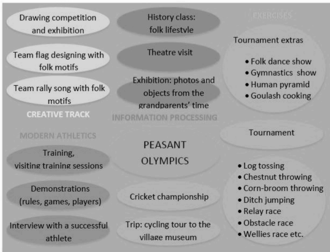
Table 1. Project-map – “Peasant Olympics“

Notes: from teacher Selmeczi's project, 2011