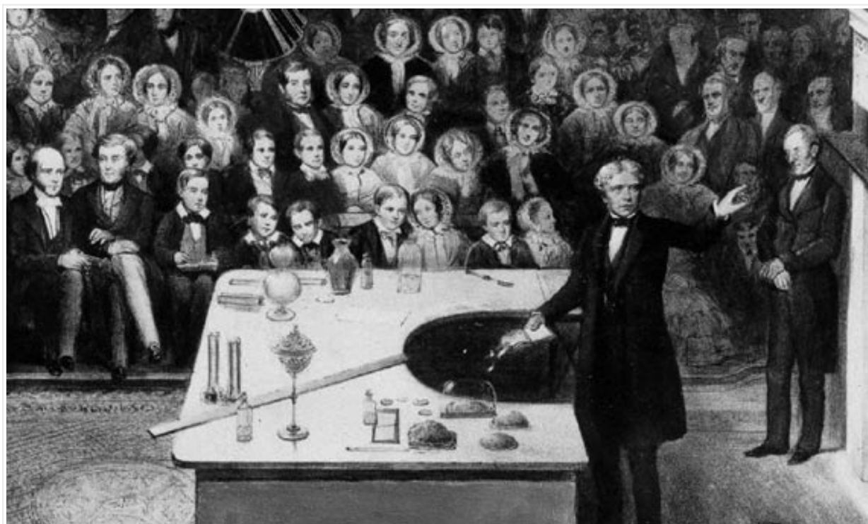
Michael Faraday delivering a Christmas Lecture at the Royal Institution in 1856

Michael Faraday was born in South London to a humble family. The only basic formal education he received was in reading, writing and arithmetic as a child. He left school when he was thirteen and started working in a bookbinding shop. His passion for science was awakened by the description of electricity he read in a copy of the Encyclopædia Britannica he was binding, after which he started experimenting in an improvised laboratory. Faraday was hired in 1813 as Humphry Davy's laboratory assistant at the Royal Institution in London, where he was elected a member in 1824 and where he worked until his death in 1867, first as Davy's assistant, then as his collaborator, and finally, after Davy's death, as his successor. Faraday made such an impression on Davy that when the latter was asked about his greatest discovery, Davy answered: "My greatest discovery was Michael Faraday" . In 1833 he became the first Fullerian Professor of Chemistry at the Royal Institution. Faraday is also recognized as a great popularizer of science. In 1826 Faraday established the Friday Evening Discourses at the Royal Institution, which are a channel of communication between scientists and laymen. The following year he launched the Christmas Lectures for young people -now broadcast on national television every year-, a series whose objective is to present science to the general public. Faraday himself gave many of these lectures. Both of them continue to this day.