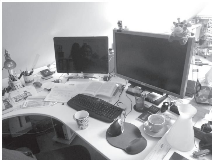
Figure 2. The front part of the translator's workplace (the Union Jack coffee cup was only placed on the desk after the observed working period).

figure 2): From right to left, she has her mobile phone, two screens (each with a specific function), a keyboard in front of them, a pile of notepaper and a pen between the screens (behind the keyboard), an iPad, a printer, files and folders, various books and dictionaries and a shredder. There are only a couple of books on the desk (e.g., on English style, a parallel text); most other translation-related books (e.g., dictionaries, grammar books, etc.) are stored in a bookcase directly behind her seat, but none of these were used during the observation period.