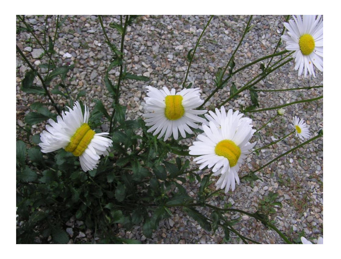
Figure 2 – Mutated daisies, photo entitled "Fukushima Nuclear Flowers"

Students were presented the image in figure 2 , along with the posting information and background information of the picture, as follows. The image was posted to a website called Imgur, a picture sharing website, in July 2015. This occurred 4 years after the nuclear disaster in Fukushima Daiichi. This information was perhaps given to provide causation for an ill-founded connection between the image and the certain belief that the mutation was caused by the nuclear fallout. The title of the image is "Fukushima Nuclear Flowers" and the caption reads "not much more to say, this is what happens when flowers get nuclear birth defects" (Wineburg 17).