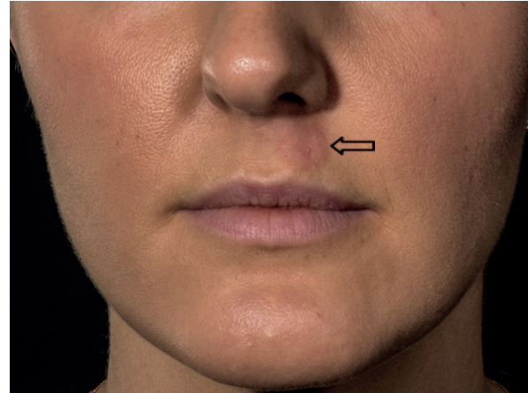
Fig. 1. Clinical presentation. Arrow indicates tumour location. The central papule represents a cicatrice after the first biopsy.

What is your diagnosis? See next page for answer.