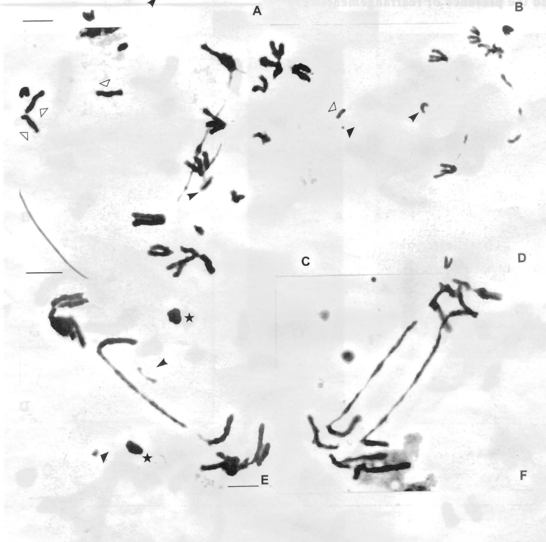
Figure 2. Anaphases in Alstroemeria andina var. venustula . A-D: anaphase I; A, B: almost all homologue chromosomes are segregated except the largest pair; A: chromosome pair n° 1 with double bridges. In the same cell, a chromatid loop (arrowhead) indicated the presence of another paracentric inversion in heterozygosis in a different chromosome pair (a possible explanation for this meiotic figure: if in addition to a chiasma in a paracentric inversion loop, one occurs in the interstitial segment between the centromere and the inversion; the remaining chromosome of the pair is present in the other pole of this cell, but it was difficult to individualize it); B: chromosome pair n° 1 with a dicentric bridge; C: cell with two dicentric bridges, one acentric fragment (arrowhead) possibly accompanying a bridge and at least three chromosome fragments, probably derived from breakages (empty triangles); D: cell with two dicentric bridges, one acentric fragment (arrowhead), one possible univalent (empty triangle) and one small chromatid fragment (full triangle) (incomplete complement); E-F: anaphase II, E: cell with a dicentric bridge, an acentric fragment (arrowhead), a small chromatid fragment (full triangle), and two bivalents (stars), F: cell with two dicentric bridges (incomplete chromosome complement). Figures A, B, D and figures E, F, with the same enlargement. Bar = 10 \mu m.