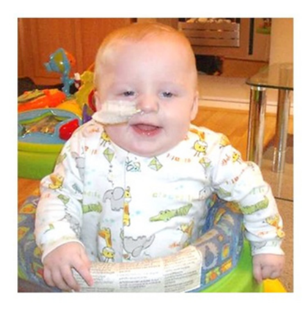
Figure 2. Case C as an infant demonstrating nasogastric tube required for feeding.

not receive any specific treatment for her myotonia. Electromyography showed permanent myotonic discharges (Figure 1C) in all cases.