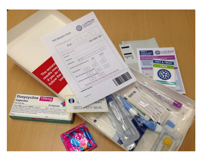
Figure 2 Contents of sex partner accelerated partner therapy pack. Pack contains: antibiotics; condoms; Limiting Undetected Sexually Transmitted infections to RedUce Morbidity TEST & TREAT leaflet; vulvo-vaginal swab kit or urine sampling kit; blood sampling kit; instruction leaflet for sampling kits; test request form for sample processing; prepaid return post envelope; security seal sticker; attention card.

calculation is based on recruiting an average of 160 index patients per clinic per trial phase from the 17 participating clinical services (total 5440 patients) and a coefficient of variation in the number recruited of 0.5. We expect that