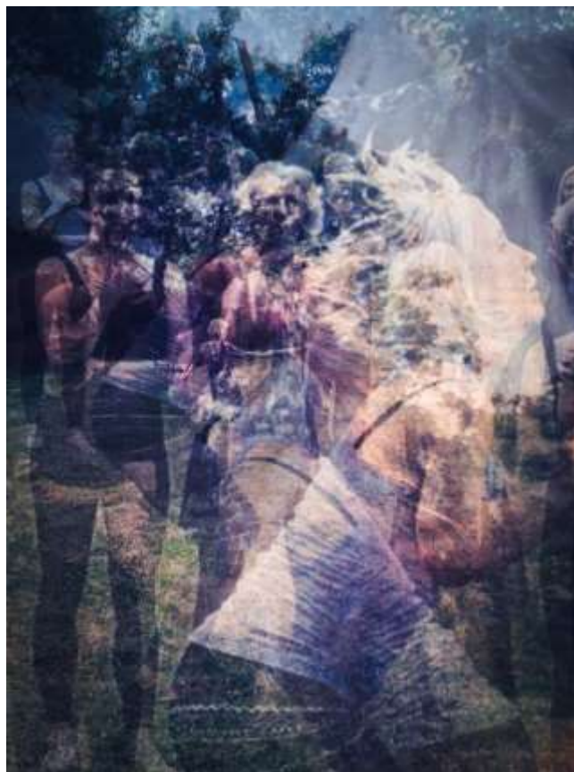
Figure 3. Dancing with Deleuze by Hickey-Moody (PhArt by Red Ruby Scarlet, 2015).