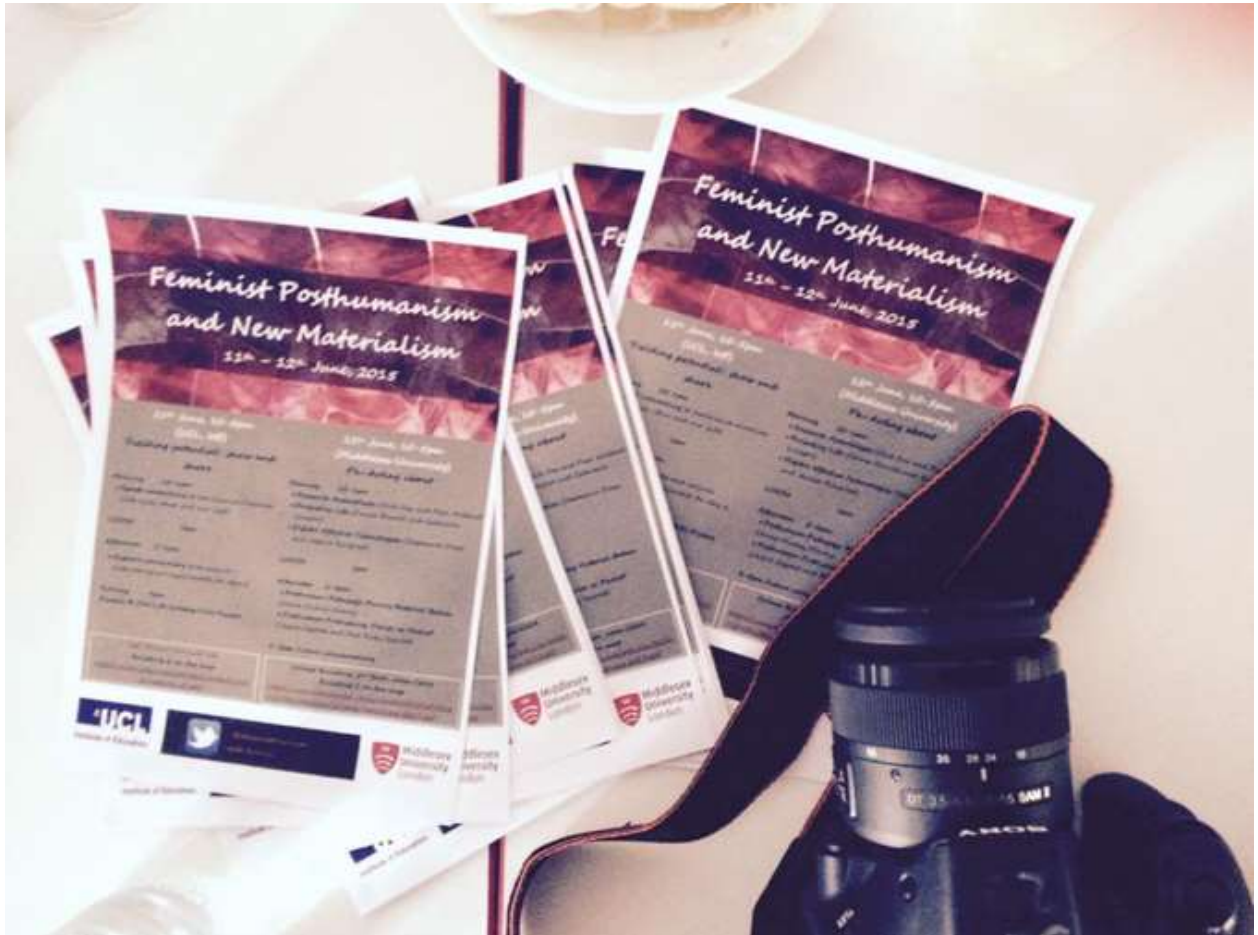
Figure 2. PhEMaterialism I, London (photo credit, Red Ruby Scarlet, 2015).

The conference, “Feminist Posthuman and New Materialism Research Methodologies in Education: Capturing Affect,” brought together 40 international educators, researchers, students, artists, and activists seeking to create generative ways of researching, teaching, and collaborating. This group is maintained, sustained and connected by a shared commitment to putting posthuman theories to work with the aim of addressing urgent injustices and operates through informal networks on Facebook, Twitter and Instagram (Link: Phematerialism ).