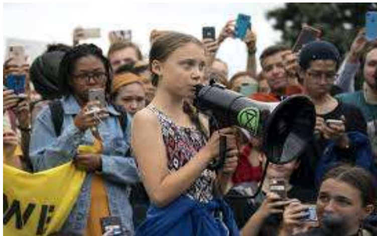
Figure 8. Greta Thunberg

My middling in the moment, a generative node of sparking excitement, is a “feminist figuration” (Braidotti, 2002) in the form of Greta Thunberg, a 16 year old climate activist who rose to international fame after catalyzing worldwide, youth-led climate strikes through her #FridaysforFuture demonstrations, which mobilised a gigantic, global, digitally networked youth following. What has been commented upon at length in the media is the medicalisation of Thunberg as autistic. After learning about climate devastation at age 8, Greta noted: “I kept thinking about it and I just wondered if I am going to have a future” (Watts, 2019). Greta was then diagnosed with depression and a form of Asperger’s, “selective mutism”, a severe anxiety disorder where a person is unable to speak in certain social situations. Thunberg herself has talked about being painfully “introverted” and doubted her ability to make change because of her small size. Yet, by demonstrating her rights to speak about what she deems important to a global audience through her climate activism, she has ruptured her pathologization. For instance, Thunberg has reported never feeling nervous or scared to speak about climate change in front of large audiences. Greta with a megaphone amplifying her voice at rallies jars against the individualising psychopathologizing diagnosis of mutism.