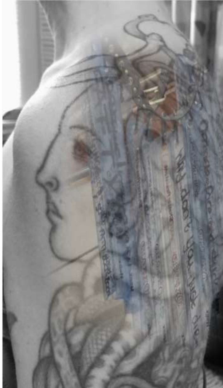
Figure 5. Skirting Medusa (Renold, 2019).

"Medusa Rising" is the fugal figuration made and shared specifically for this