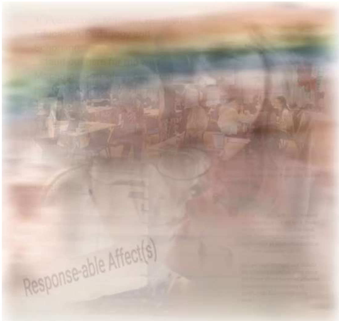
Figure 1. T(og)ethering (PhArt by Emma Renold, 2019).

As we (the four guest editors) worked toward assembling the editorial introduction to this Special Issue, we exchanged many emails, texts, Facebook prompts, Skype calls, and, when possible, met in coffee shops to work through our thinking. During one video call, we contemplated the fraught issue of how to introduce ourselves into the editorial, discussing various modes such as autobiography, figurations, poems, and artwork (see Figure 1).