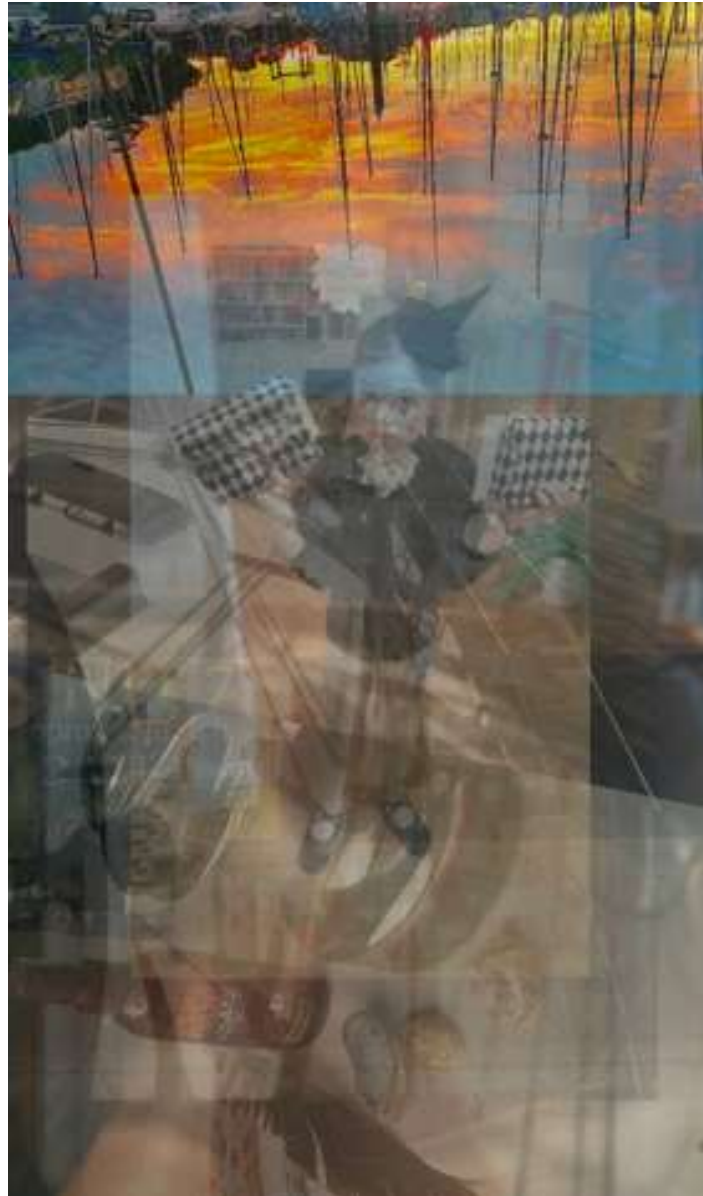
Figure 7. Reimagining anti-bias education as worldly entanglement (PhArt in Osgood et al., 2016).