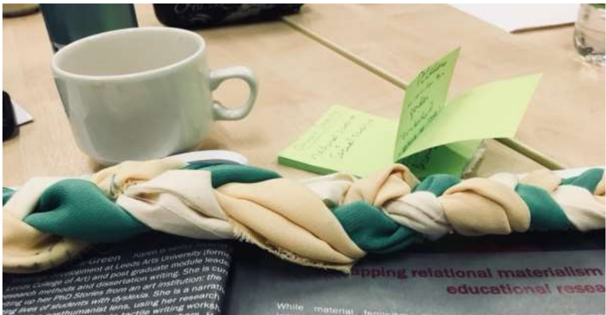
Figure 4. PhEmaterialism II, London (photo credit, Sid Mohandas, 2018).

We see our contributions as entangled threads, braids or plaits. This plaiting spirit of PhEmaterialism is captured in Figure 4 (which was taken by Sid Mohandas at the second Phematerialism conference, posted on Facebook, and re-sourced by Jayne for the purposes of this editorial). The image captures coffee, sticky notes, a conference programme and a “ plait for progress, ” a plait containing experiences and messages pressing for gender equity created in a session led by Hanna Retallack and Tabitha Millett at the conference. First conceived through a feminist conference with school children, the original plait was brought along to Phematerialism 2018 and delegates added new plaits, creating more and more entangled becomings, connections, and webs.