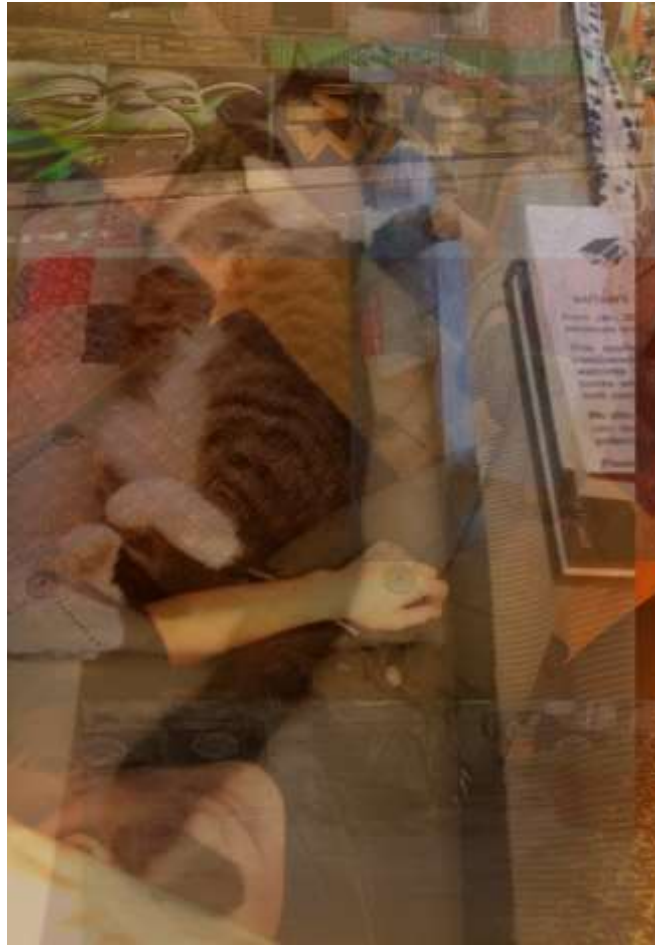
Figure 6. The ordinary affects of situated knowing (PhArt by Osgood, unpublished).