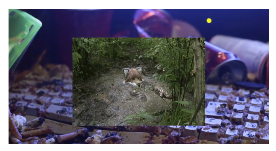
Figure 3 Jon Rafman, Still Life (Betamale), 2013. Single channel video. Photo: screenshot.

The exoticism of this spectacular fantasia is startling, however what emerges most consistently from its awful pageantry is a tapestry of motifs in which sex and violence not only appear bound in over-proximity but are couched in the cultural forms of genres which make an express appeal to childhood fantasy and entertainment, whether in the form of infantilised anime characters, dressing up as cuddly animals or by reference to the antisocial environs of a teenager's bedroom. Speaking at the exhibition of Still Life at the Zabludowicz Collection in London, Rafman made space for psychoanalytic theory as a tool with which to probe his material, observing that 'in the various subcultures I reference, there is something infantile in that their desires are base and regressive as well as in the sense that they're simply returning to the original desire, seeking those pleasures through the screen'.4 Whilst this discussion is more concerned with the particular relationship between subjects and subculture set up by the work being originally addressed to 4chan users, rather than the ways in which its subsequent exhibition in spaces such as the Contemporary Art Museum St. Louis and the Stedelijk Museum were framed by physical installations that cocooned his audience in womb-like structures, the notion of an intransigent desire, both general and particular, lodged in infantile sexuality speaks directly to what I propose is at stake in the work.