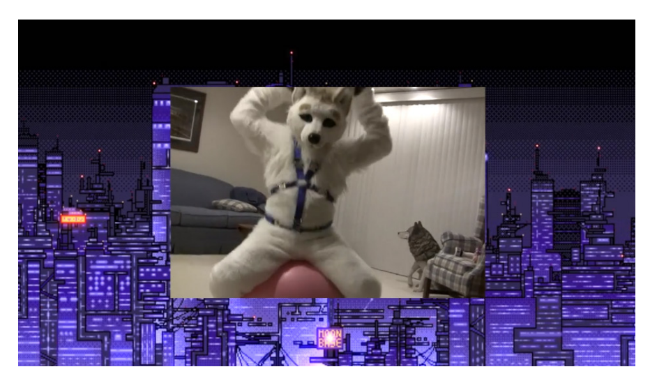
Figure 5 Jon Rafman, Still Life (Betamale), 2013. Single channel video. Photo: screenshot.

retains its capacity to stimulate pleasure whether through masturbation or in fantastical daydreams.