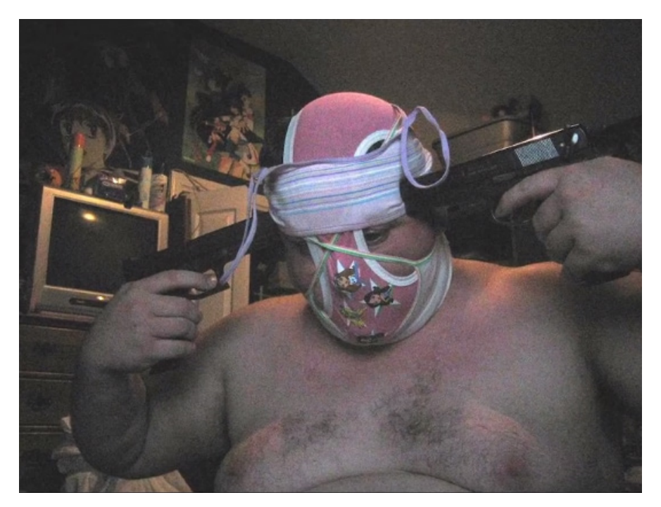
Figure I Jon Rafman, Still Life (Betamale), 2013. Single channel video. Photo: screenshot.

At the beginning and the end of the film, Rafman lingers on what is, to my mind, the most arresting image of Still Life , first zooming toward the perimeter of the frame before reappearing and then fading to black at the film's dénouement (figure 1). It shows a grainy photograph of an unknown man with an assortment of clothes wrapped around his head in the manner of a bondage mask whilst he holds a revolver to each temple. The man is obese and shirtless, the size, colour and pattern of the underwear suggest they belong to a young girl. The room he is sitting in is dark and cluttered with the debris of a teenager's bedroom. Posters behind his head show characters from manga animations which will feature heavily throughout the rest of the four minutes and 54 seconds of the video. In the following passage more low-res photographs of dark, mostly fetid, rooms are presented in a slideshow. Typically they contain a configuration of a bed and a monitor arranged for the purpose of spending prolonged periods of time at the computer. The video takes a keen interest in the abject condition of these lairs, hovering