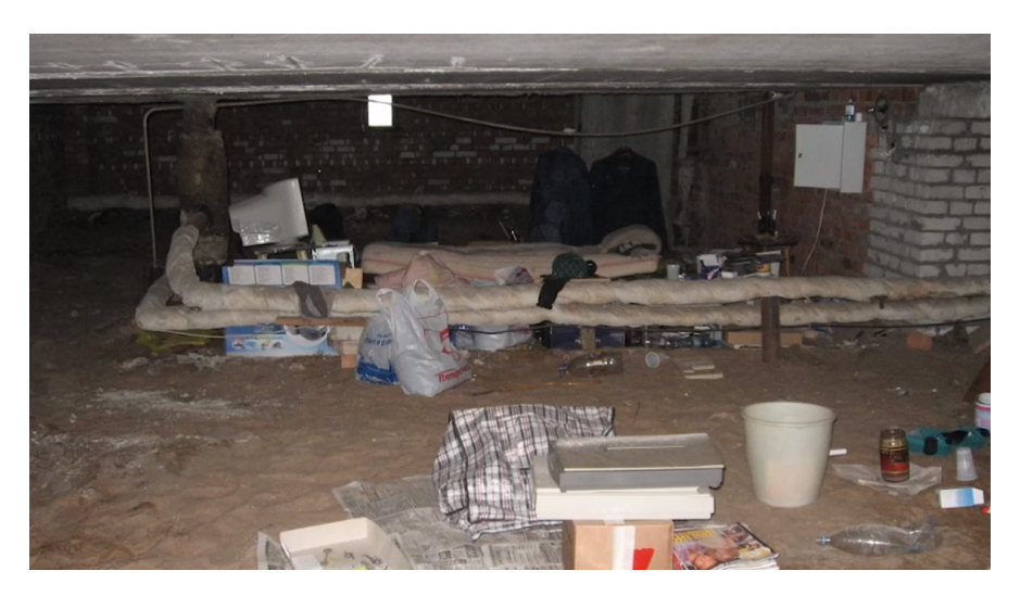
Figure 2 Jon Rafman, Still Life (Betamale), 2013. Single channel video. Photo: screenshot.

over keyboards covered in a morass of congealing food matter, drinks cans, bucket toilets, cigarette butts and discarded pizza boxes.