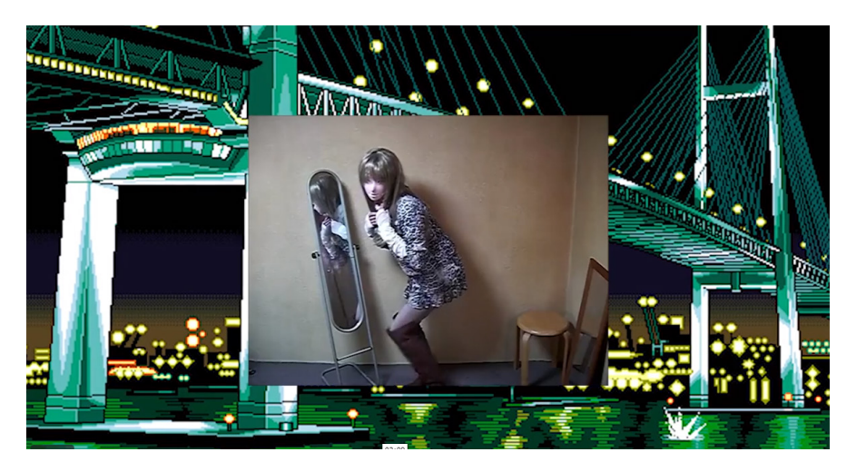
Figure 8 Jon Rafman, Still Life (Betamale), 2013. Single channel video. Photo: screenshot.

the network before being opened by another user – the bodies and artefacts that are extracted from the file are received as set of equivalent modular objects remotely generated and all the more remote for it. Wrenched from their ground (another displacement), a sense of shared material distinction or analogical relation is lost as contextual reality is subsumed by the highly subjective workings of fantasy. Symptomatic of what has been understood as digital image production's attack on the authority of the referent, the proximity of cartoon violence to the threat of physical violence in Still Life points to the dangers of dismantling in their entirety the conceptual borders between media as technologies that each carry an evolving set of challenges to representational systems in the context of online fantasy.<sup>37</sup>