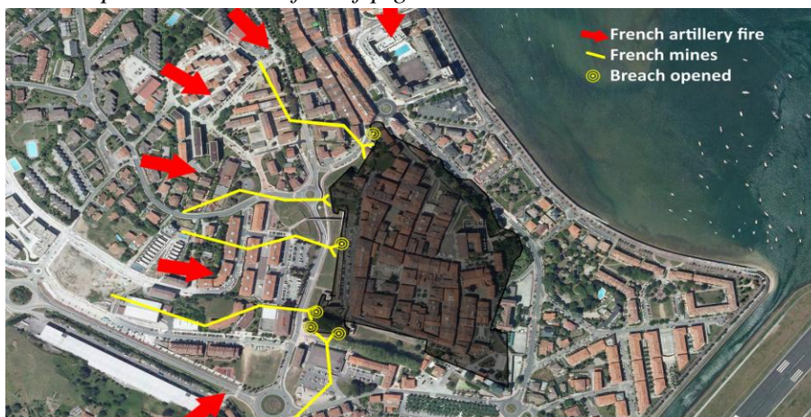
Figure 6. French Attacks. Own Production: Warfare Diagrams Overlaid with Aerial Orthophoto Extracted from ftp.geo.euskadi.net

Hualde troops had arrived to help the besieged, who were repairing and rushing the works, and on September 6th the French released another attack entering the vanguard into the moat in a new assault. The enemy began to climb the breach while being attacked from inside to avoid it, even fighting