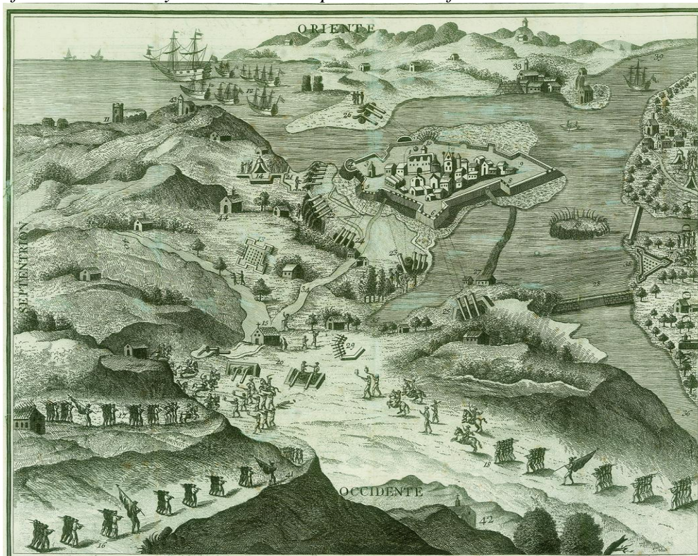
Figure 5. View of the Stronghold of the City of Hondarribia during the Assault of the French Army in 1638.

On August 1st they had evidence that the French were working in a mine and the next day, the two sides of the bastion of Leiva fell into the moat and gabions were placed to increase the height the wall. Local forces began to fail inside the fortifications of Fuenterrabía, while the French were very advanced in the process. The heavy rains of the past days made the French stockade collapse, and they used a sailing ship to hide the mine they were building. The high tide made it difficult to withdraw because the water was reaching the trench and they did not enter the breach they had opened. The besieged encircled the inner space of the old fortifications sticking beams and built a rampart, being able to use this second fortification when the first one failed.