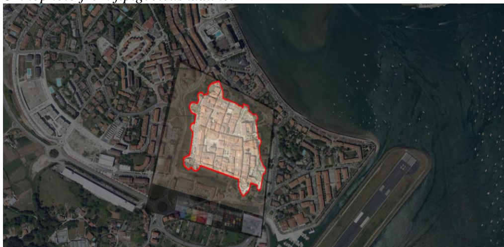
Figure 1. Own Production: Overlay of AGS. M. P. y D. XIII-55 and Aerial Orthophoto from ftp.geo.euskadi.net