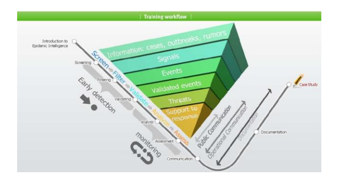
Figure 1. Process of Epidemic Intelligence (taken from [3])

ProMED-mail, Puls) as identified by a comparative study on a detection of A/H5N1 Influenza Events [2] highlighting the need for "more efficient synergies and cross-fertilization of knowledge and information". The systems, as required for the purpose of this roadmap article, will be discussed greater detail and referenced in the following section.