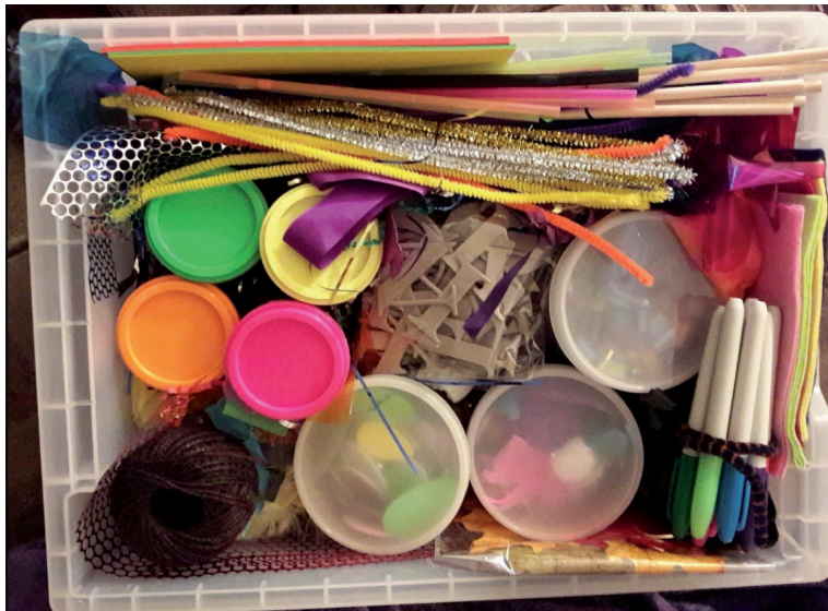
Figure 1: The collage box

Interviews opened with an opportunity to talk about when, why and how the participants became teachers, with the aim of establishing a trustful rapport. After that, and with prior notice by email, participants were asked to talk about 'a time when you knew you were struggling', an open question that allowed them to direct and control their narrative. When these accounts seemed to come to an end, I suggested setting up the collage-making activity. All had been informed in advance that this would be part of the first interview and I had reassured them that it was not about their artistic ability. All 14 participants created a collage using the materials I provided; some added various personal items from their home to their collages. For example, one participant used a body board as the underlay for his collage. Another participant wanted toothpicks, so got some from his kitchen.