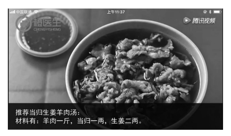
Figure 14.1 Screenshot of recipe for tonic soup

to check. It is also very convenient to share them with others who you care about, you simply click a few times. For example, I heard an old friend of mine was suffering from rheumatism, I sent him this video about the benefit of green bean soup . . . A previous middle school classmate of mine told me the other day that her daughter-in-law, 39, is pregnant again. I recalled a few days ago I watched a short video talking about food restrictions for older pregnant women, so I forwarded this video to her.