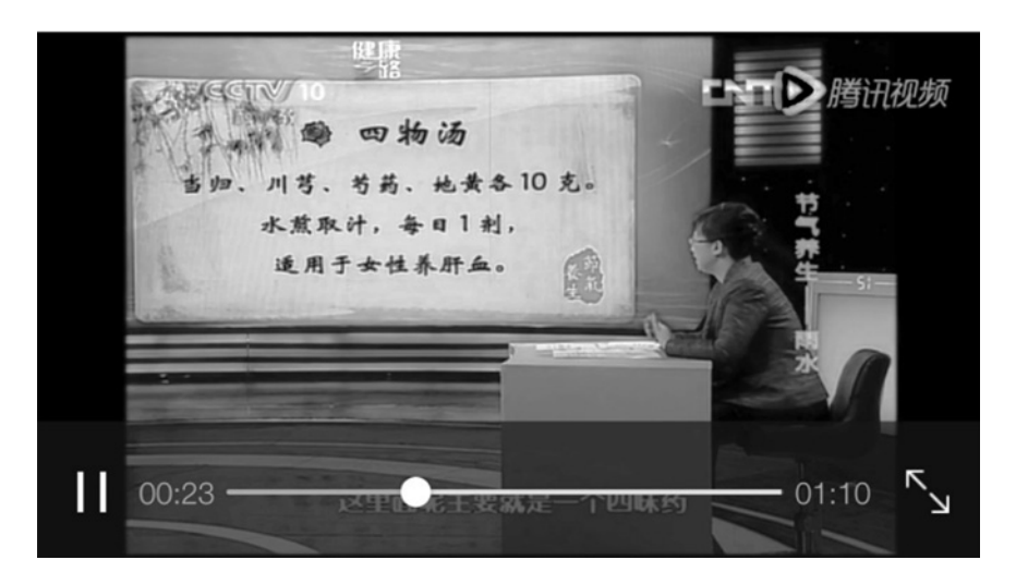
Figure 14.2 Screenshot of one-minute short video on the benefits of siwu decoction.

decoction (Figure 14.2). This decoction is widely used to 1) tonify and invigorate the blood; and 2) regulate the liver, harmonise the menses, and alleviate pain. It is made from four herbs: processed Chinese foxglove root ( dihuang 地黄), white peony root ( shaoyao 芍药), Chinese Angelica root ( danggui 当归), and Szechuan lovage root ( chuanxiong 川芎). The second short video illustrates how to prepare the decoction with these four medical materials (Figure 14.3).