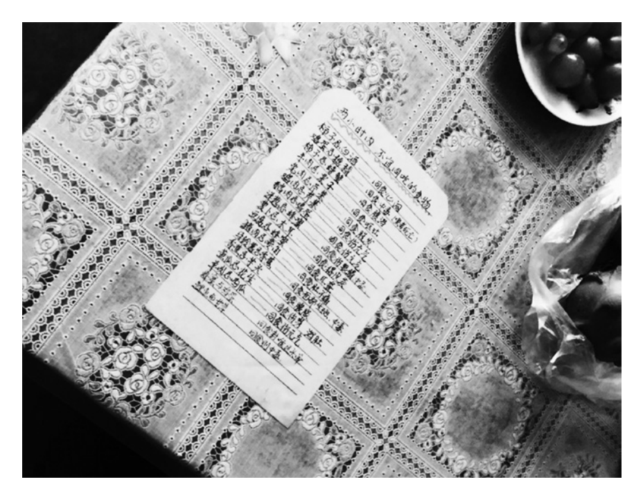
Figure 14.6 Handwritten list of food prohibitions by Ms Wang

It is common to see retirees keeping the knowledge of 'food restrictions' in the form of newspaper clippings or handwritten notes. Ms Wang (71) still keeps a handwritten list of food restrictions underneath the transparent mat of her dining table (Figure 14.6).