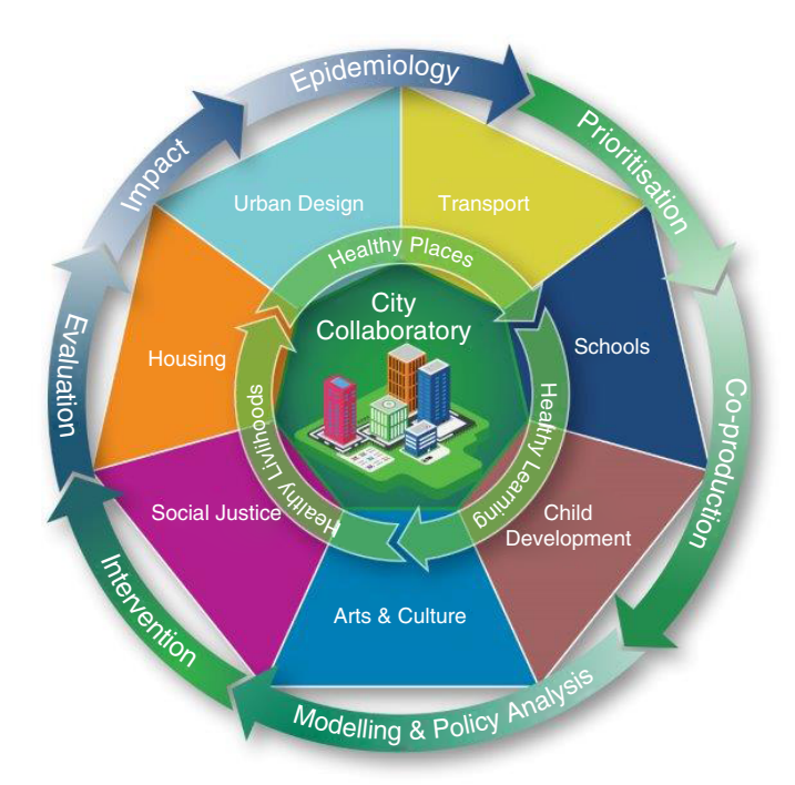
Figure 1. The City Collaboratory model utilises wide interdisciplinary expertise based in three inter-linked themes: Healthy Places, Healthy Learning and Healthy Livelihoods.

We have started our co-production activities, developing, refining and prioritizing the suite of activities outlined in each work