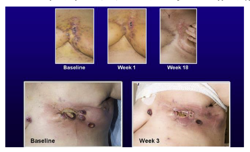
Fig. 1. Clinical responses to brivanib in patients with angiosarcoma.

AEs (regardless of causality) that occurred in \geq 10\% of the overall trial population are shown in Table 3. The most common AEs (>25% of patients) were fatigue, nausea, vomiting, decreased appetite, hypertension and