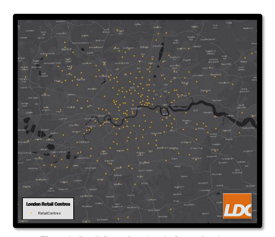
Figure 1: Retail Centre Locations in Greater London.

The Local Data Company (LDC), who specialise in maintaining accurate and current locations of retail centres around the UK, provided the retail centre location data. There are 291 retail centres in Greater London (see Figure 1).