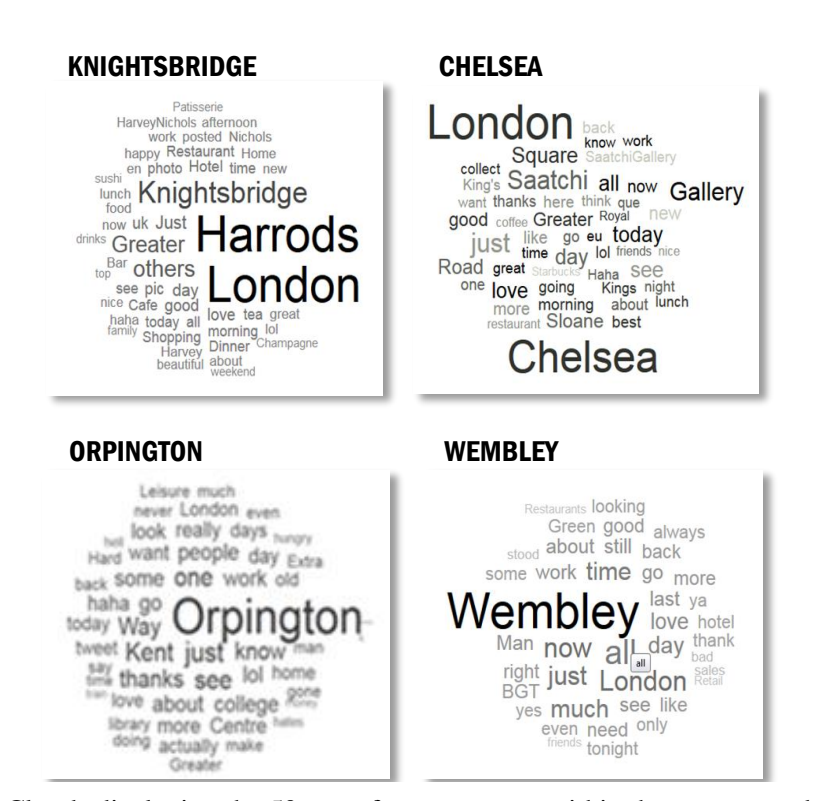
Figure 3: Word Clouds displaying the 50 most frequent terms within the two top and bottom ranked retail centres in Greater London ( where larger term means a more frequent occurrence ).

The Knightsbridge catchment area contained 2836 tweets from 2117 users, Chelsea contained 1200 tweets from 947 users, Orpington 347 tweets from 204 users, and Wembley 260 tweets from 158 users. Tweets from these locations can be transformed into wordclouds for early assessment of content and word frequencies (see Figure 3).