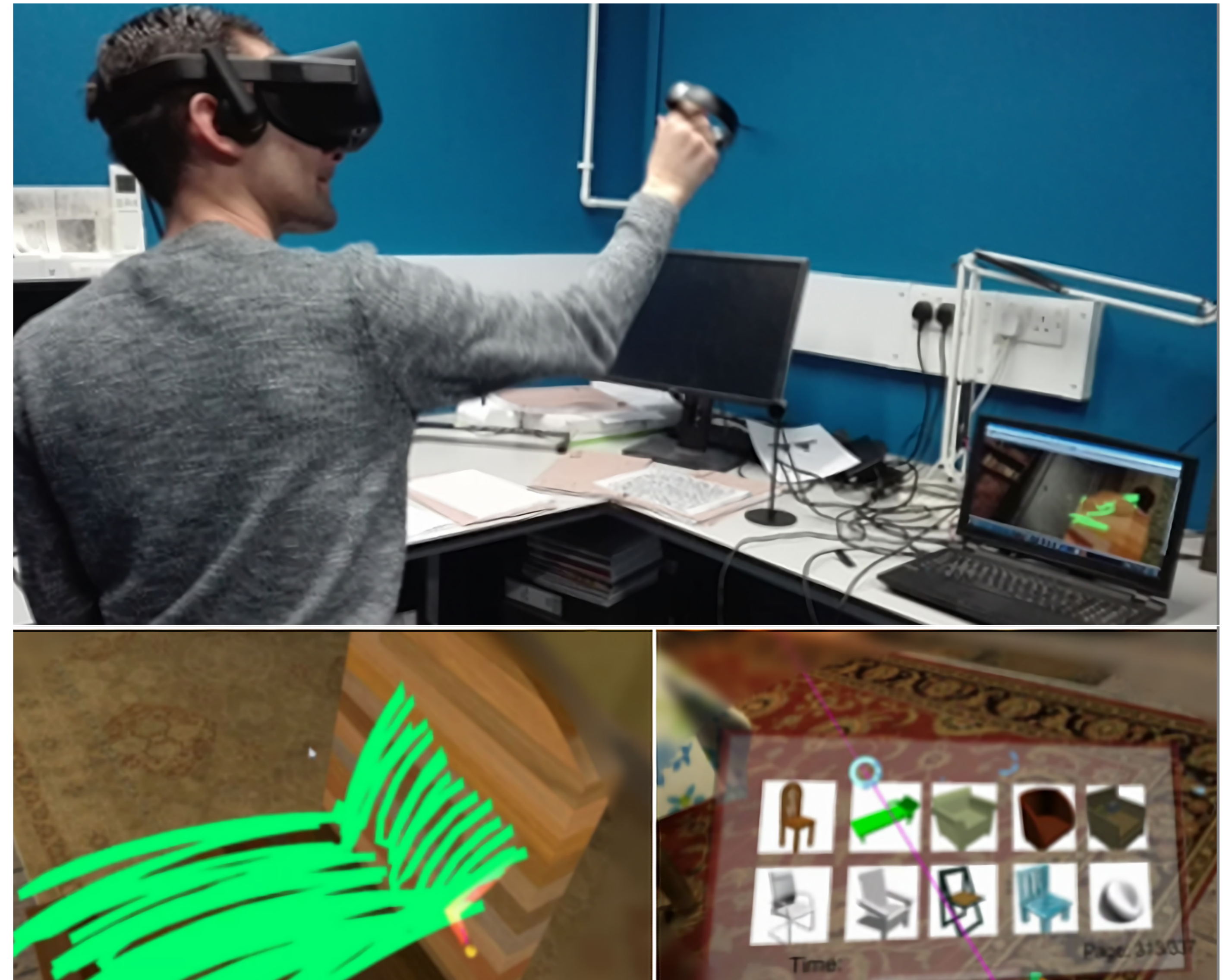
Figure 3: Our interface lets the user draw coloured sketches in a virtual environment and select iteratively one model from the retrieved set.

Two different user strategies emerged from the experiment: sketch only and sketch with a model. The first and more intuitive approach is to make a single sketch and detail it step by step until most features of the chairs are resolved without replacing the model. The second approach is to model differences to the current object: that is the user queries the system and then only adds features that are different in the target object. The sketch is usually started again after each query. The advantage of this method is that the quick response from the system (2 seconds) enables fast iterative refinement. This method requires more experience from the user, but after few iterations we observed several participants starting to adopt it.