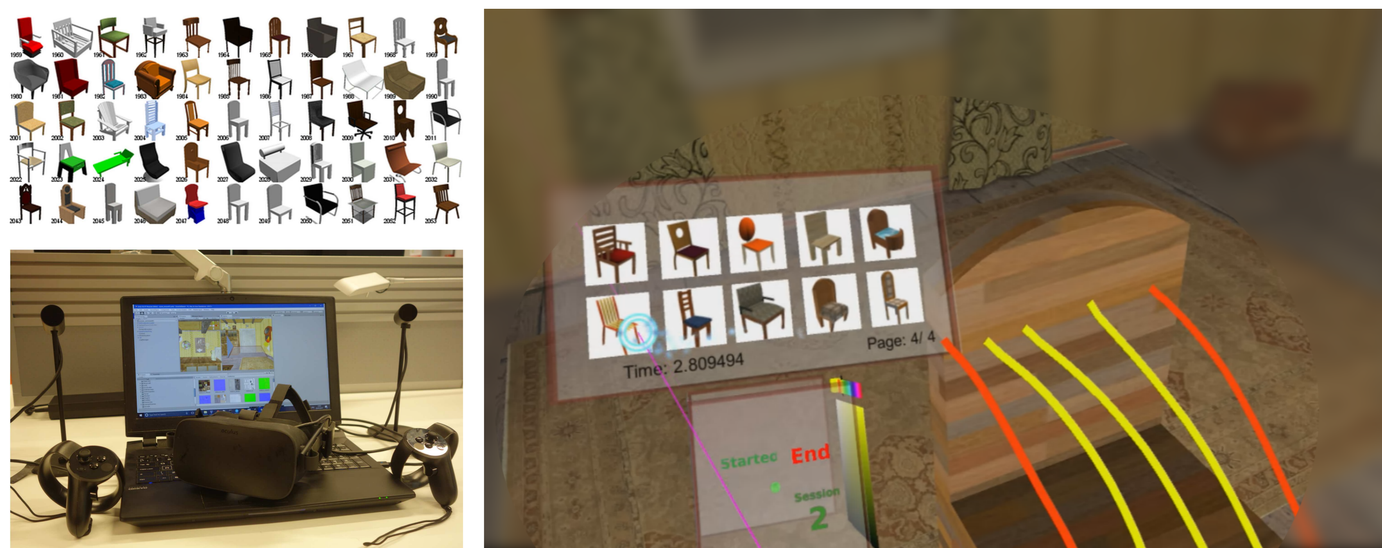
Figure 1: Top left: a collage of the chairs class models. Bottom left: laptop, Oculus Rift and Touch. On the right the interface implemented for sketching

In our system (showed in Figure 1), the user is immersed in a virtual reality display. We provide an example model of the class to act as a reference for the user. The user can then make free-form coloured sketches on and around this base model. A neural net system analyzes the sketch and retrieves a set of matching models from a database. The user is then able to iterate, making further correctional sketches (e.g. adding new pieces to the model or refinements) until they find their target object.