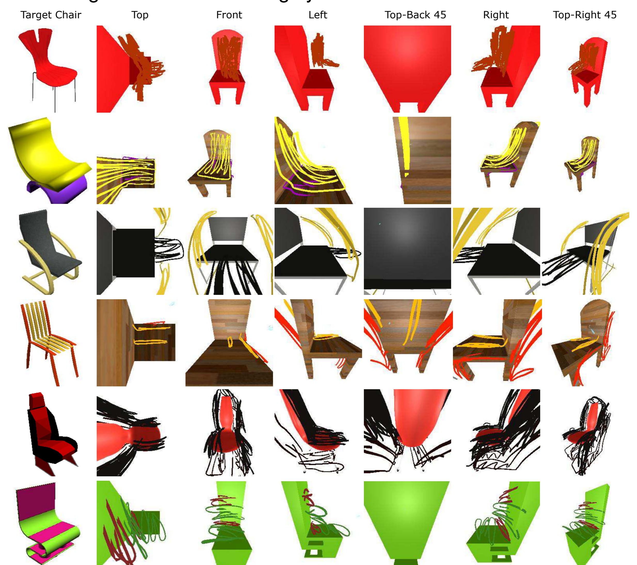
Figure 4: Leftmost column: target chairs. The other columns show the visual queries.

We proposed a novel interaction paradigm that helps users to select a target item using an iterative sketch-based mechanism. We improve this interaction with the possibility of combining sketches and a background model together to form a query (as showed in Figure 4) to search for a target model. An experiment collected information about the time taken to complete the task and user experience rating. We thus believe that sketch-based queries are a very promising complement to existing immersive sketching systems.