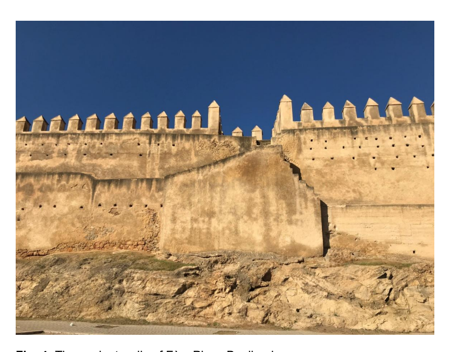
Fig. 4: The ancient walls of Fès, Place Boujloud.