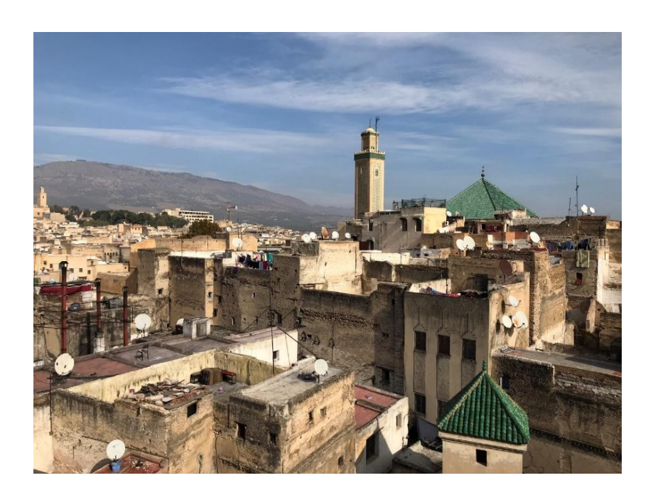
Fig. 1: The Medina view from tanneries, with the green glazed roofs of the al-Qarawiyyin Mosque and University. In the left side, it's visible the Atlas mountain chain and the minaret of al-Ándalus mosque.

[26] UNESCO. Convention for the Safeguarding of the Intangible Cultural Heritage, Paris: UNESCO Editions, 2003. Available at: <a href="https://unesdoc.unesco.org/ark:/48223/pf0000132540">https://unesdoc.unesco.org/ark:/48223/pf0000132540</a>