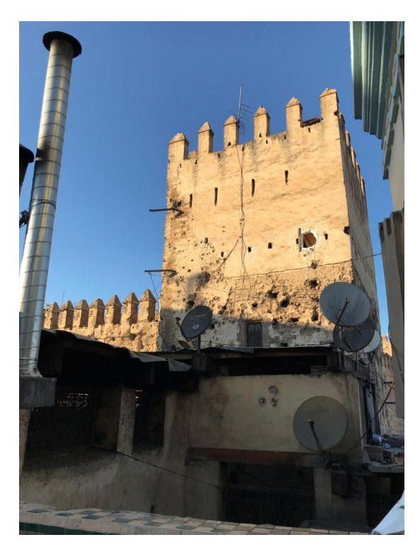
Fig. 6: Details of the earthen masonry of a fortified structure (northern district).