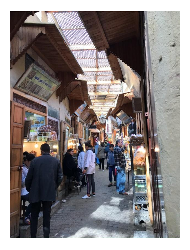
Fig. 2: The bakery and pastries souk near the Friday Mosque, with the wooden grates covering.