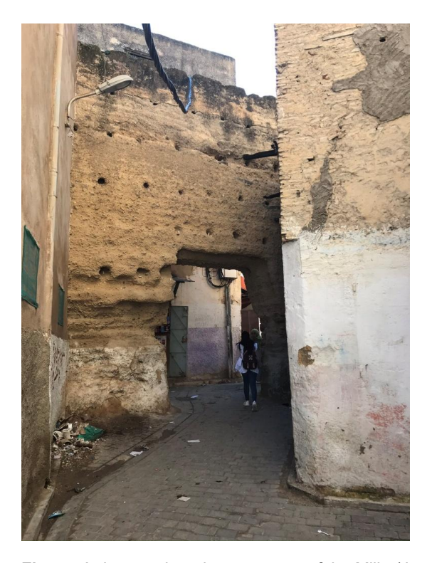
Fig. 5: A damaged earthen structure of the Milla (Jewish) district.