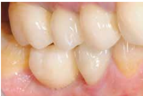
FIG. 3: Soft tissue healing at 6-month follow-up in xenogeneic dermal matrix group (X).

After 6 weeks of healing, the restorative procedures were performed: implants were manually tested for stability, impressions were taken using polyvinyl siloxane impression material and customised resin impression trays. Final prosthetic restorations were screw-retained or cemented, peri-apical x-rays and impressions were taken, and patients were enrolled in an oral hygiene programme with recall visit every 3 months (FIGS. 3, 4).