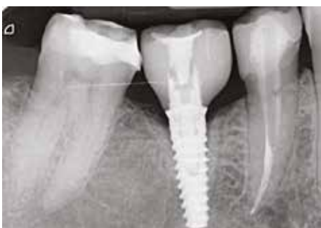
FIG. 4: X-ray at 6-month follow-up in xenogeneic dermal matrix group (X).