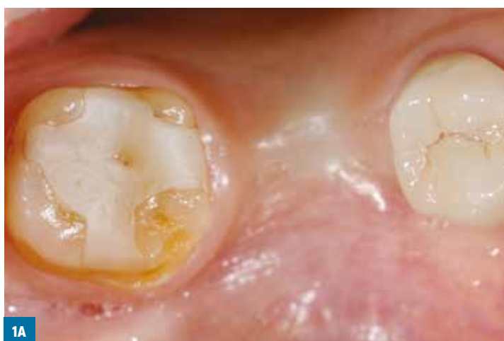
FIGS. 1 A, B: Preoperative image, before implant uncovering stage, showing edentulous ridge with mandibular right first molar missing and reduced keratinised tissue in xenogeneic dermal matrix group (X).