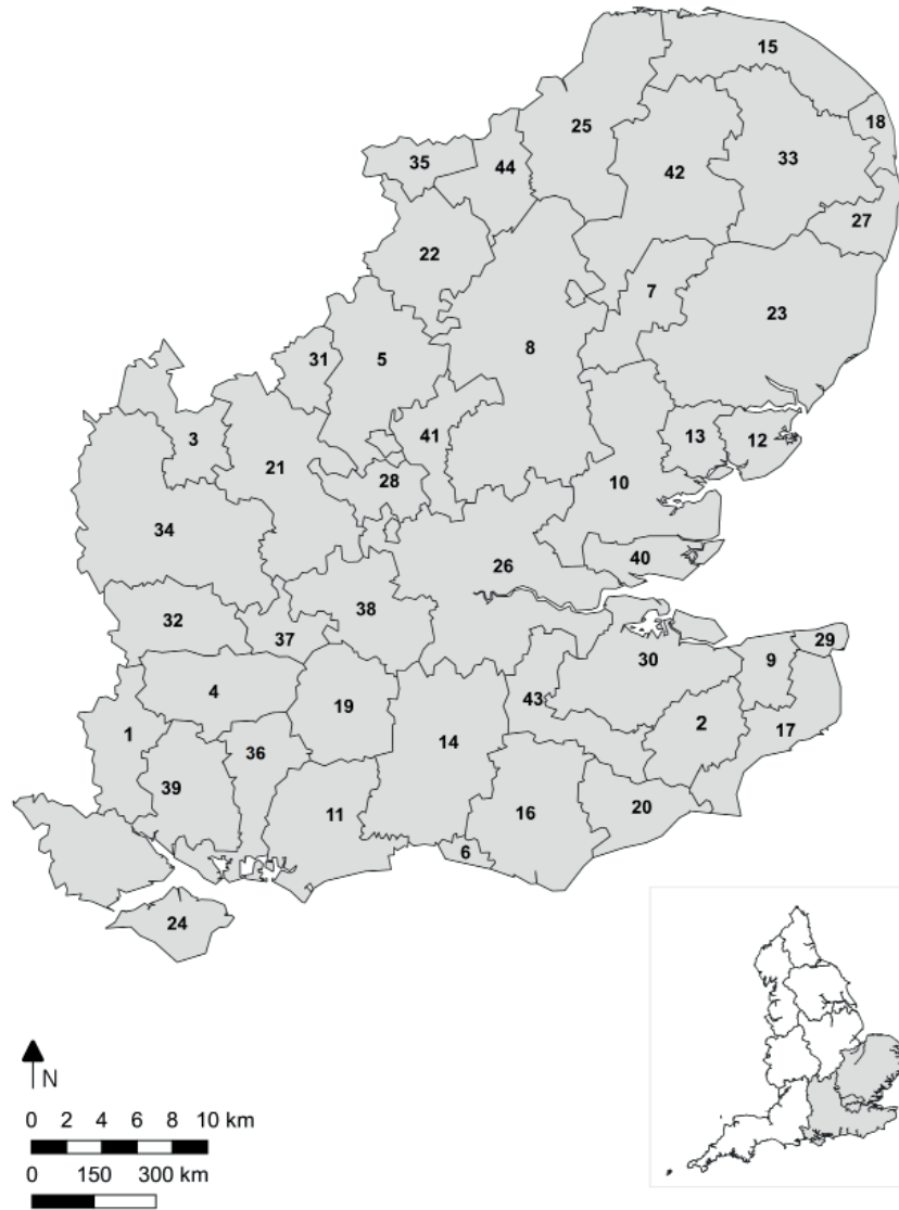
Fig. 3: The WSE's TTWA geography

Contains OS data © Crown copyright and database right 2011