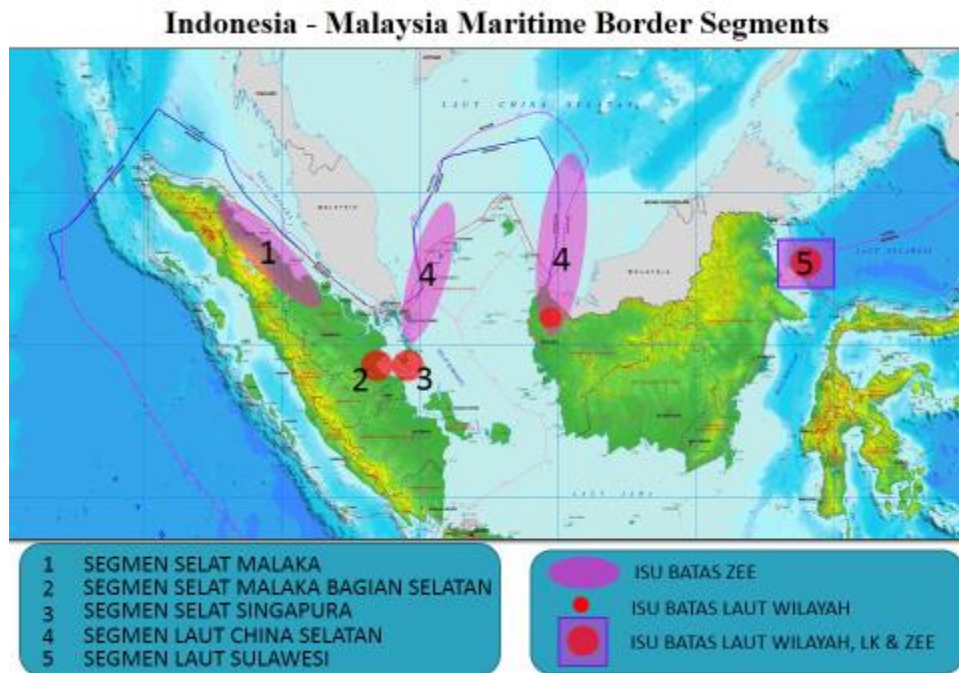
Figure 2, Map of Indonesia - Malaysia Maritime Border Segments (Foreign Affairs, 2014)

The map below shows several segments of the Indonesian and Malaysian maritime boundaries that still need to be resolved and agreed upon between the two countries. For segments in the South China Sea, Indonesia and Malaysia need to agree on the EEZ limit.