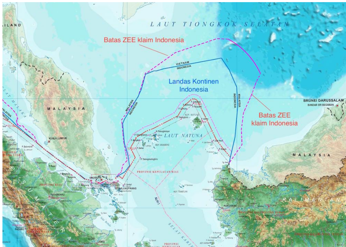
Figure 1, Map of Overlaps in North Natuna Waters (South China Sea), ( http://madeandi.staff.ugm.ac.id/2016/03/28/berebut-ikan-di-laut-tiong-china-selatan/ )