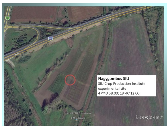
Figure 4. Satellite photo of the Experimental site of the SIU Crop Production Institute Nagygyombos, 2016.