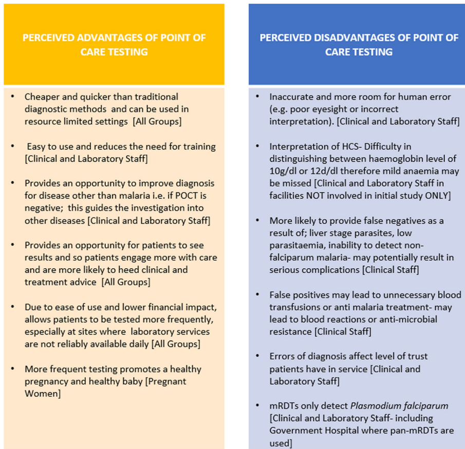
Fig. 1 Perceived advantages and disadvantages of Point of Care Testing for malaria and anaemia