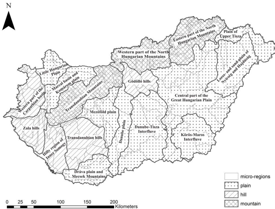
Fig. 1. Mesoregions of Hungary, created from 230 microregions – by combination with the geomorphological categories and landscape types

mentioned climate elements what can provide a base for drawing relevant conclusions from the aspect of forecasting landscape sensibility and changing landscape usage.