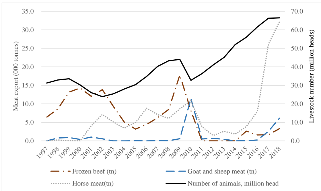
Figure 2 Livestock number (million heads) and meat export (thous. tonnes)