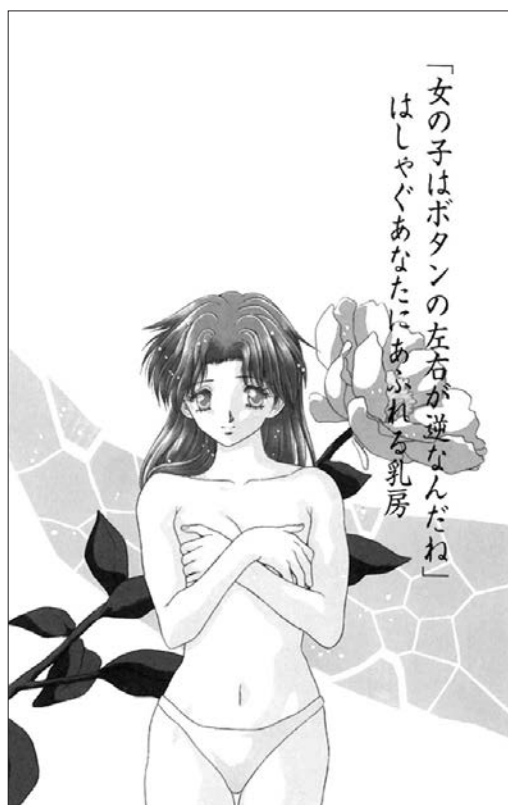
Figure 1: Illustration plate and poem (‘Girls have their...’) from the opening of Hayashi's tanka adaptation of Katsu Aki's Step-Up Love Story X-Rated Couple . Reprinted with permission from Hakusensha.

It is possible to read this poem as simply having 31 morae if one views each of Hayashi's couplings of the final consonants “ n ” together with their preceding morae as one unit. In that case “ o-n-na ” (women) would have two, not three beats; similarly, “ bo-ta-n ” (button) would also have two, not three beats. Were that so, then one would expect Hayashi to be consistent about squeezing these nasal final consonants “ n ” into the preceding mora to always save one beat, but one can find exceptions where Hayashi clearly uses “ n ” for an individual beat in other poems. For example, the poem below is one of the few orthodox 31-mora poems in the collection; it also uses the word “ botan ” (button):