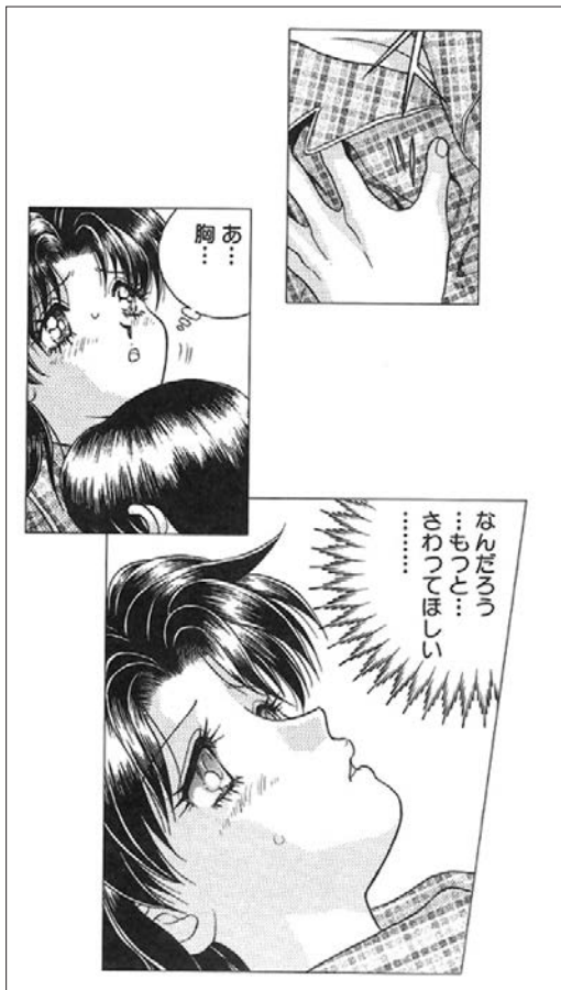
Figure 2: Example of a manga sequence interspersed in Hayashi's tanka adaptation (page 17) of Katsu's X-Rated Couple . Taken from the second installment of Katsu's manga, this scene depicts the virginal Yura beginning to desire Makoto's touch.

of inadequacy. Although some of these hypometric poems still feature ji-amari measures, Hayashi leaves other measures deficient in 5- or 7-mora length, resulting in poems that range anywhere from 28 to 30 morae. These ji-tarazu poems often do not express excess emotion or excitement but instead convey a sense of anxiety or embarrassment, as apparent in the poem below that only has 29 morae ( 4 / 4 / 5 / 8 / 8 ); here, Hayashi bookends a set of two awkward ji-tarazu measures against a set of more confident ji-amari ones. In this poem, Yura hears Makoto confess that he has masturbated, but she does not reprove her sexual partner. True to the original manga character, Hayashi's Yura exhibits a maternal tendency to accept Makoto regardless of his indulgent faults ( amae ):