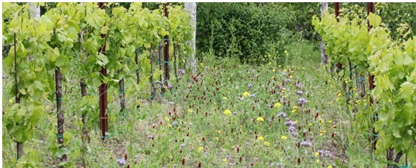
Sown cover crops within a Slovenian vineyards

The capacity of plant diversity to increase the resistance of crops towards pests and invasive species is well-known. However, monocultures such as vineyards do not fully exploit the potential of plant diversity. BIOVINE aims to develop new viticultural systems based on increased plant diversity within (e.g., cover crops) or around (e.g., hedges, vegetation spots, edgings) vineyards by planting selected plant species for the control of arthropod pests, soil-borne diseases and foliar pathogens. To control arthropod pests, plants species can either i) repel arthropod pests or ii) conserve and promote beneficials. An extensive systematic literature search was performed to identify plant species suitable for repelling the grapevine moth ( Lobesia botrana ) and for conserving and promoting beneficials.