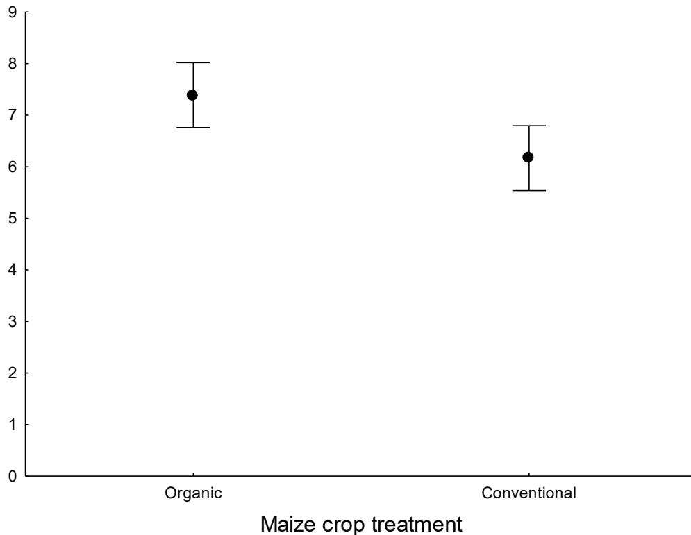
Figure 5. Helicoverpa armigera pupae removal in maize crops cultivated under conventional and organic treatments in an area belonging to Embrapa Maize & Sorghum, in the municipality of Sete Lagoas, MG.

absence of the gallery that the larva digs to lodge in the ground. This gallery has chemical signals emitted by the pupae, such as kairomones (Parra et al., 2002), which are perceived by the parasitoids and so allowing their encounter.