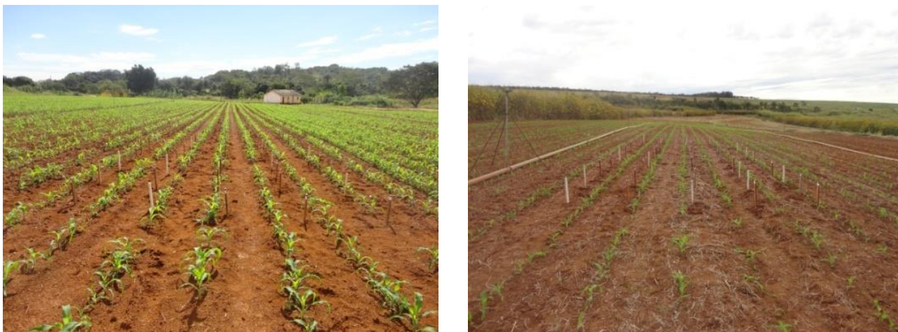
Figure 2. Details of conventional maize crop (A) and organic maize crop (B) in an area belonging to Embrapa Maize & Sorghum, in the municipality of Sete Lagoas, Brazil. Stakes indicate the burial position of each pupa in the areas.