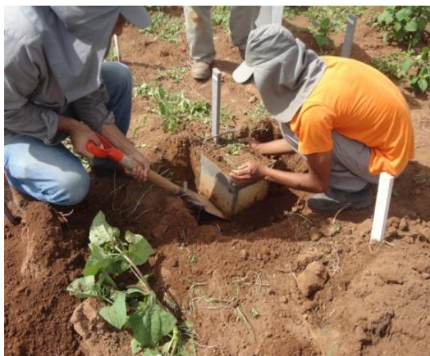
Figure 3. Representation of the template on the ground (A) at the desired depth and template removal with a trench shovel (B). This process was carried out in the maize crop, with conventional treatment and organic treatment, in the area belonging to Embrapa Maize & Sorghum, in the municipality of Sete Lagoas, MG.

natural enemies. Other edaphic macro-organisms identified by date, crop, and sample point stay in a 96% alcohol dilution.