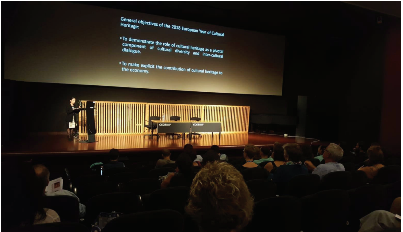
Figure 5.- Keynote lecture on the relevance of World Heritage by Sophia Labadi (University of Kent, UNESCO consultant).