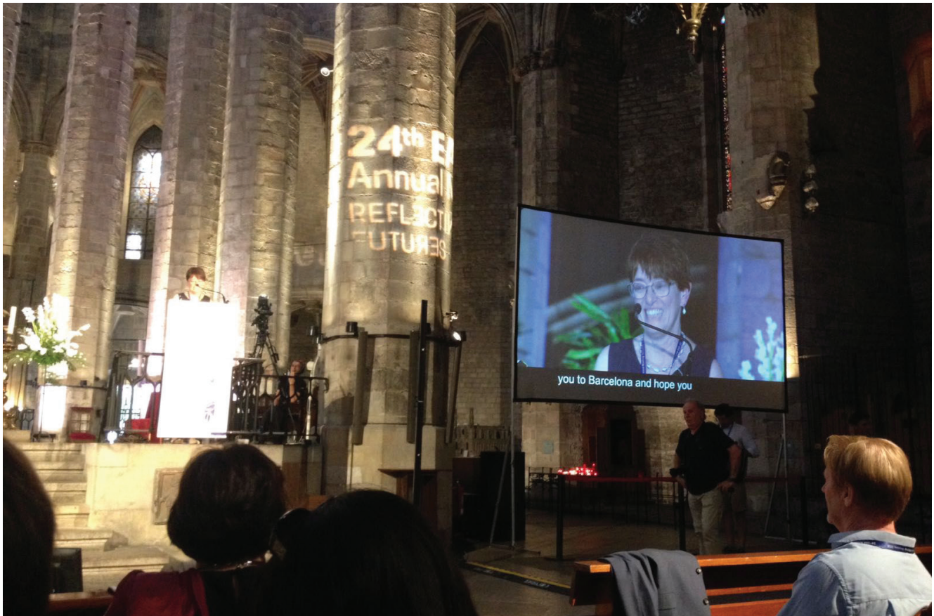
Figure 3.- Inaugural ceremony held at Santa Maria del Mar on 5 September 2018.

subject matter of the 260 sessions and almost 3,000 presentations (174 as posters) was extremely varied (Figure 4). This is to be expected during a period of theoretical, although perhaps not methodological, stasis currently experienced in archaeology.