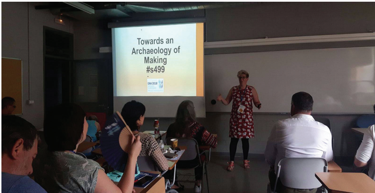
Figure 4.- "Towards an archaeology of making" session on 8 September 2018.