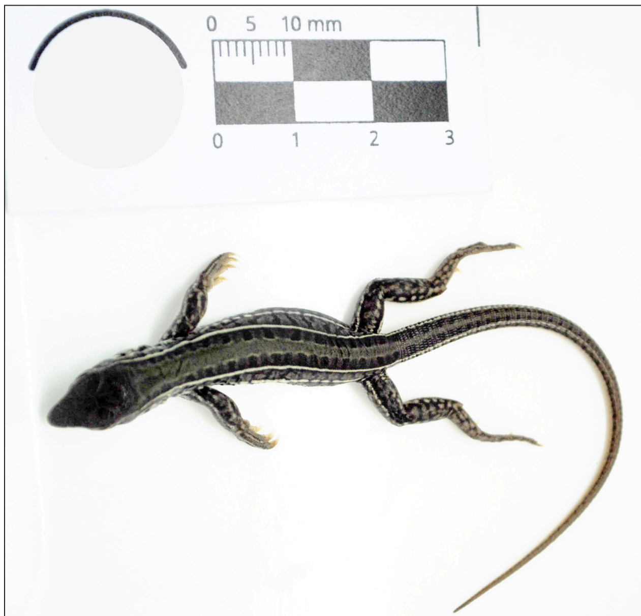
Figure 2. The collected specimen of Teius suquiensis from Zavalla (FCA-ZV-R: 012).

Comments — The genus Teius Merrem, 1820 at present includes three species: Teius teyou (Daudin, 1802); T. oculatus (D'Orbigny & Bibron, 1837), and T. suquiensis Avila & Martori, 1991. The latter is the only species in the genus that is known to have parthenogenetic reproduction in Argentina (Avila et al. , 1992). Some recent studies on its distribution (Cacciali et al. , 2016) limit its presence to two disjunct areas: one in the north-west corner of Santa Fe province and the other in the center, north and west of Córdoba province, extending into the north-eastern San Luis province. From the biogeographic point of view, the species occurs on the southern border of the Wet Chaco, being more abundant in the