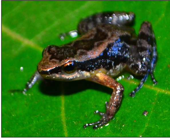
Figure 2. Adult male of Allobates goianus (SVL 17.80 mm; ZUFG15052) from the new locality of occurrence in municipality of Goiânia, state of Goiás, Central Brazil.

10% and housed in the Zoological Collection of the Universidade Federal de Goiás (ZUFG 15052 and ZUFG 15053).