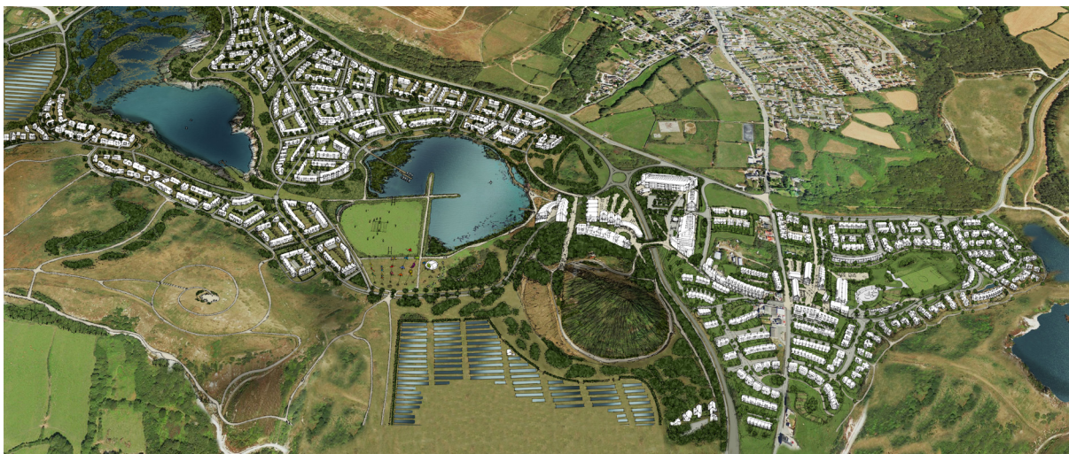
Fig. 3. Aerial perspective of the West Carclaze Garden Village development.