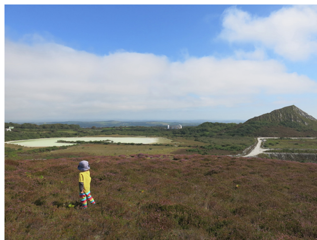
Fig. 1. An example of the distinctive pattern of pits and tips in the Clay Country, here with the former Great Treverbyn Pit (now a mica settling pond) next to the Great Treverbyn Tip, with an area of restored heathland in the foreground. Photo by Caitlin DeSilvey, 15/9/2019.

China clay is essentially decomposed granite, created through a process of ‘kaolinisation’ in which feldspar deposits in the granite transform into kaolinite, a fine white powder (Bristow, 1996). In the middle of the eighteenth century, Plymouth chemist William Cookworthy discovered that kaolinite could be used in the making of porcelain, and subsequently the substance has acquired a range of other uses, in the production of paper, paint, plastics, cosmetics and pharmaceuticals (Barton, 1966; Thurlow, 2005; Wheal Martyn, 2012; Cornwall Mining Alliance website). Since extraction and production of china clay began in Cornwall in the eighteenth century, the primary china clay deposits in Cornwall have “yielded more than 165 million tonnes of marketable clay” (Kirkham, 2014: 3). To appreciate how china clay mining has shaped the landscape, an understanding of the three main phases of the process is key: extracting involves breaking up the clay in situ through the use of high-pressure washing techniques;