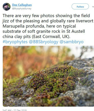
Fig. 4. Twitter post from Des Callaghan on 22 December 2018 describing the rare liverwort's presence in St Austell.

Here, there is an admission and an acceptance of potential transformational change. The implication is that the Sky Tip may not retain its present-day shape, although it will be present in the landscape in some form. Following the approval of the development in 2019, a new website was issued, which highlighted on its FAQ page, in response to the question 'Will the Sky Tip remain', "Yes, the Sky Tip will remain as it is today..." (West Carclaze Garden Village website, 2019). This reinforces the ambiguity associated with the Sky Tip's meaning as a heritage object which assembles and embodies both natural and cultural elements. If the previous website text appreciated the Sky Tip's eroding nature – and therefore its gradual transformation as a natural material entity – the new website seems to promise a more stable, fixed form. This shift in language aligns with commitments given under Schedule 9 of the Section 106 Agreement, which safeguards against any further re-profiling of the Sky Tip (Cornwall Council, 2018: 76), noting that "any significant amendments to the profile would require a separate planning application" (Cornwall Council, 2017: point 65).