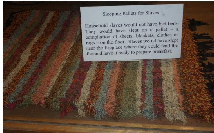
New exhibit: rug placed in the Twain Boyhood Home Museum Kitchen. 112