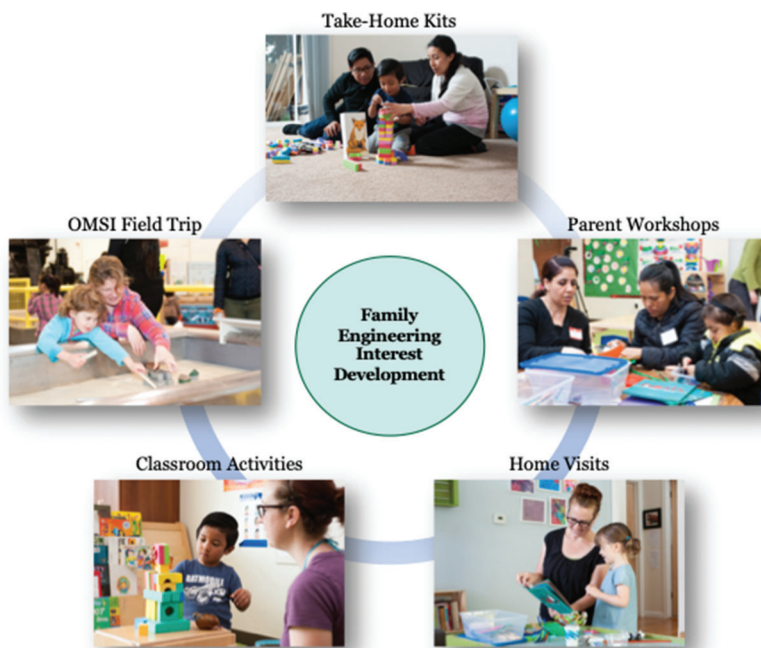
Figure 1. Primary components of the HSE program.

(d) home visits by Head Start staff; (e) classroom activities to complement engagement at home; and (f) a culminating field trip to OMSI (see Figure 1). These are described in more detail below.