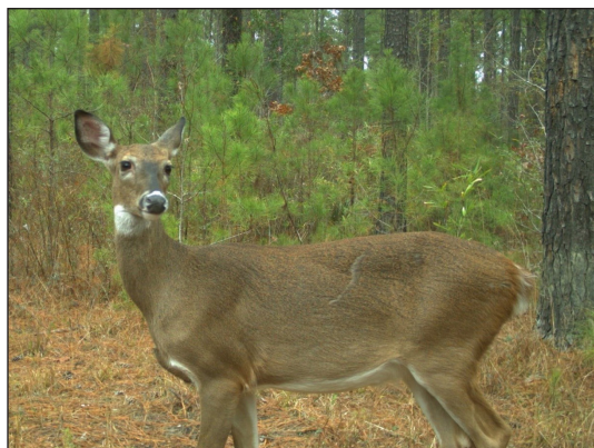
Figure 1. A female white-tailed deer ( Odocoileus virginianus ) stands on the edge of a right-of-way on the Savannah River Site, South Carolina, USA.