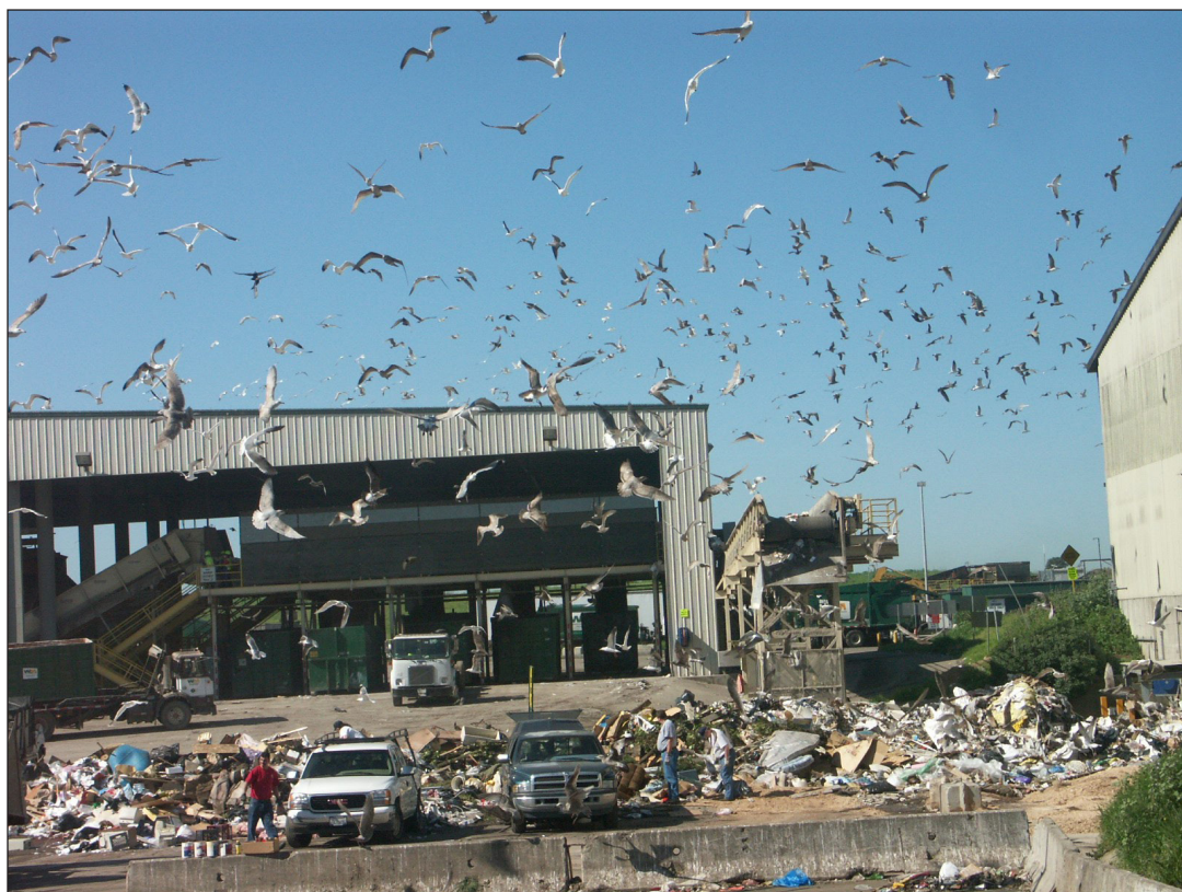
Figure 1. Flock of gulls scavenging at a waste transfer station.