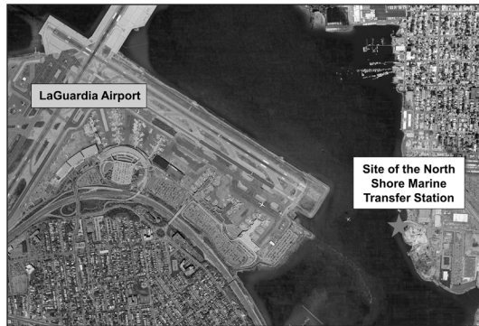
Figure 2. Map showing the location of the LaGuardia Airport and the North Shore Marine Transfer Station, College Point, New York, USA.