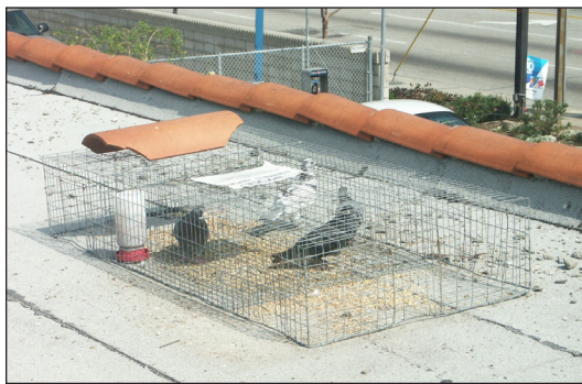
Figure 3. Cage trap used to live-capture rock pigeons ( Columba livia ; photo courtesy of USDA Wildlife Services).

operational procedures, DSNY could operate the NSMTS facility with low risk to aircraft operations associated with LaGuardia Airport (LGA; Washburn et al. 2010). The DSNY agreed to implement all of the technical panel's recommendations during the construction and operation of the NSMTS facility.