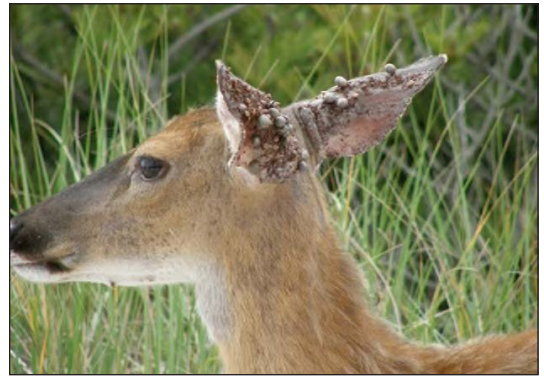
Figure 4. Blacklegged ( Ixodes scapularis ) and lone star ( Abyomma americanum ) ticks on the ears of a white-tailed deer ( Odocoileus virginianus ) from Long Island, New York, USA.

High deer abundance can negatively impact plant communities and biodiversity (Tilghman 1989, deCalesta 1994, deCalesta and Stout 1997,