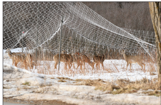
Figure 8. White-tailed deer ( Odocoileus virginianus ) under drop net prior to capture at Fort Drum near Watertown, New York, USA.

plan in place to deal with such controversy.