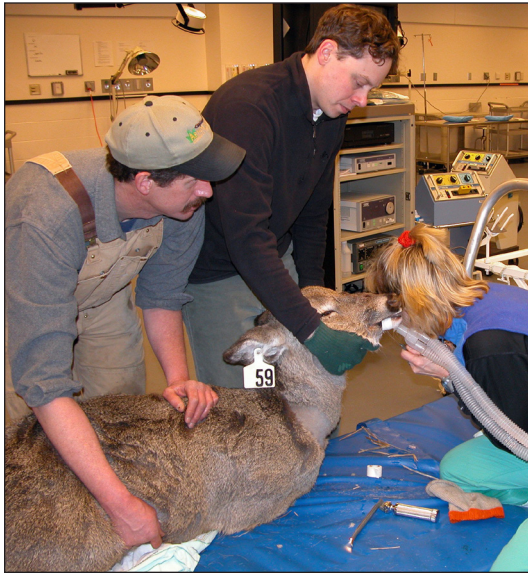
Figure 9. Preparing a female deer ( Odocoileus virginianus ) for sterilization surgery at the Cornell University College of Veterinary Medicine, Large Animal Surgery Suite, Ithaca, New York, USA.

2012). Communities that start with managing deer by fertility control often either add lethal deer removal after a few years in a combined approach, switch to lethal deer removal alone, or abandon deer management altogether (Boulanger et al. 2014).