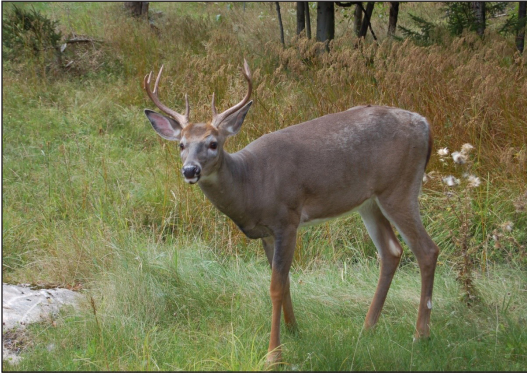
Figure 1. Mature white-tailed deer ( Odocoileus virginianus ) buck along a roadside in Old Forge, New York, USA.