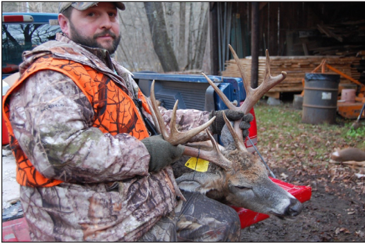
Figure 6. Successful deer hunter on Cornell University lands at the Arnot Teaching and Research Forest near Ithaca, New York, USA.

needs further implementation and evaluation. This method may be particularly useful at places where deer impacts are so severe that native wildflowers and tree seedlings are essentially absent from forest understories.