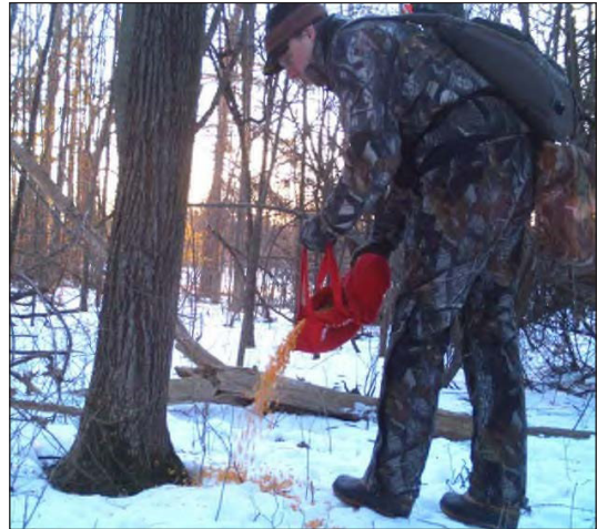
Figure 7. Sharpshooter baiting site with corn at dusk for white-tailed deer ( Odocoileus virginianus ) removal after dark on Cornell University lands near Ithaca, New York, USA.

If there are only a few places in a community where deer can be safely shot, or if community members are unwilling to support methods that involve shooting, alternative approaches to population reduction will be necessary. Professionals can be hired to capture deer with traps, nets, or immobilizing darts, and then kill the deer with either a captive bolt device or chemical injection (e.g., potassium chloride). However, there are several negative consequences of these methods. Trapping causes stress and possible injury for the deer (Figure 8). Use of a captive bolt on a wild, non-sedated animal is challenging for the operator. In addition, use of chemicals renders the carcasses unsafe for human consumption, so the deer must be taken to landfills, and the meat is wasted. Such waste may reduce community and political support for deer management efforts. In addition, community leaders and elected officials may experience bulk email letter campaigns from animal welfare groups intended to stop the program. Communities should have a well-developed communication