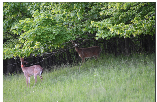
Figure 5. White-tailed deer ( Odocoileus virginianus ) feeding at a browse line about 1.8 m (6 ft) above ground at the tree line edge.

Waller and Alverson 1997, Horsley et al. 2003, Rooney and Waller 2003, Côté et al. 2004). But assessing deer damage to plant communities and biodiversity is not a simple process. There are many different ways to measure deer impacts to woody vegetation or wildflowers, and no single method is ideal for all situations and landscape scales (Figure 5). Methods that seem to work well on large landholdings (deCalesta 2013) may not be suitable for small properties. Timing may be critical for documenting wildflower impacts, and the time frame and sampling method may not fit agency staffing or time constraints. Although numerous studies clearly document deer impacts to plant communities and biodiversity, developing a quick and reliable index for measuring effects at the community level has been challenging. A newer approach, the oak-sentinel method (Blossey et al. 2019), is showing promise but