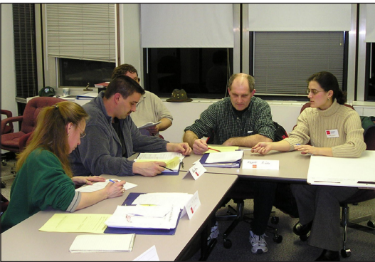
Figure 2. A Citizen Task Force for setting white-tailed deer ( Odocoileus virginianus ) management objectives in New York State, USA.

impacts because human fatality rates may be much higher.