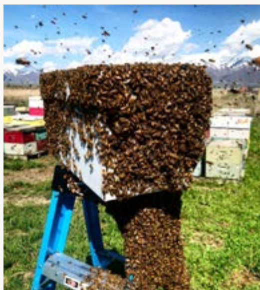
Figure 1. A captured swarm of bees moving into a nuc box. Once the queen moves inside the box, the remaining bees will follow her inside.