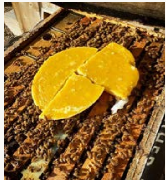
Figure 3. Determine a strong hive by the number of frames covered with bees in the brood boxes. The hive pictured shows an example of a strong hive.

There are several ways to split a hive. The techniques vary but are largely based on whether you can locate the queen, if you want to purchase a new, younger queen, or if you want the colony to rear their own queen.