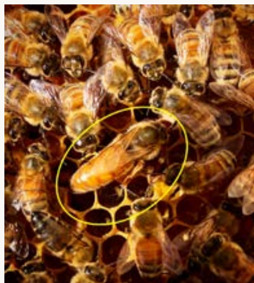
Figure 5. Queen bee (circled) surrounded by her attendants. A queen bee can be difficult to spot; look for an elongated abdomen and a hairless shield, often darker in color, on the back of her thorax.