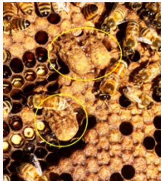
Figure 2. The long, peanut-shaped cells in the center of the photo are queen cells (circled).

There are many factors that contribute to swarming behavior such as rising populations, limited space, overabundance of food resources, and the age of the queen. However, the exact mechanism that triggers the swarm's departure