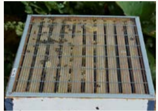
Figure 4. A hive body with queen excluder. The excluder allows bees, except the queen, to pass through, limiting the queen's movement in the hive.