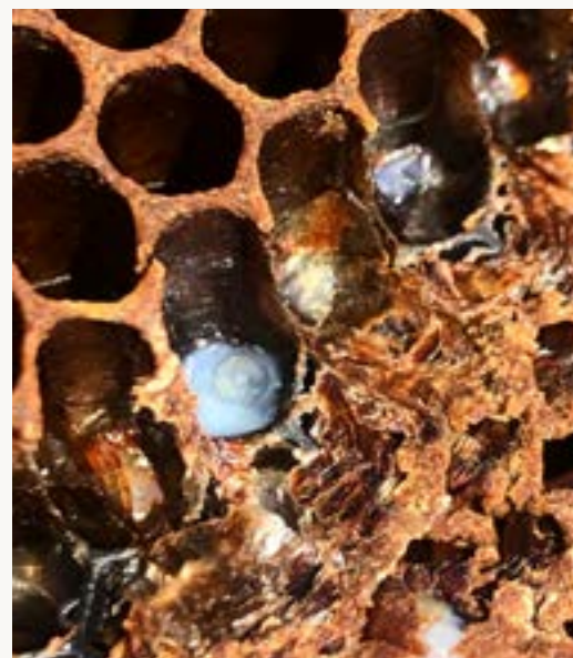
Figure 7. Notching comb with newly hatched larvae is a technique used in OTS queen rearing to encourage the building of new queen cells.