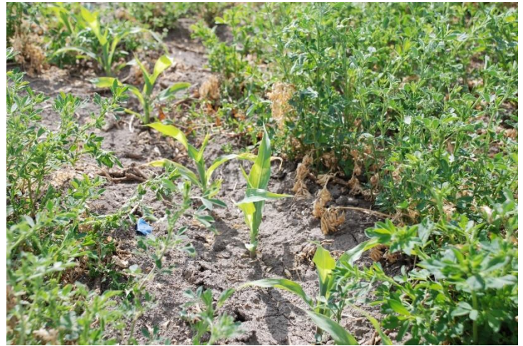
Figure 2. Failure to control alfalfa regrowth prior to planting can lead to substantial corn yield loss, even with conventional tillage.

The increased corn yields from effective alfalfa termination when herbicides are used easily justify extra costs. Herbicide options for removing a conventional alfalfa stand include glyphosate alone plus tillage or a combination of glyphosate plus 2,4-D or dicamba. However, chemical removal of Roundup Ready alfalfa varieties generally is accomplished with