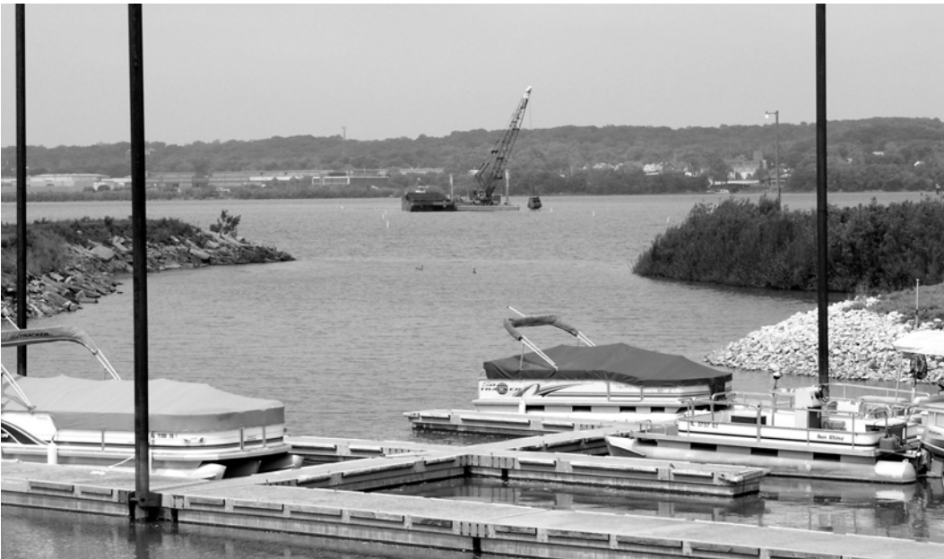
Figure 3. The work barge inches its way toward the Spindler Marina at East Peoria Illinois as it fills a hopper barge destined for Chicago, 270 km (168 mi) upriver. The Peoria Lakes are about 32 km (20 mi) long and about 1.6 km (1 mi) wide. Sedimentation has decreased their average depth to approximately .76 m (2.5 ft) during the past century.