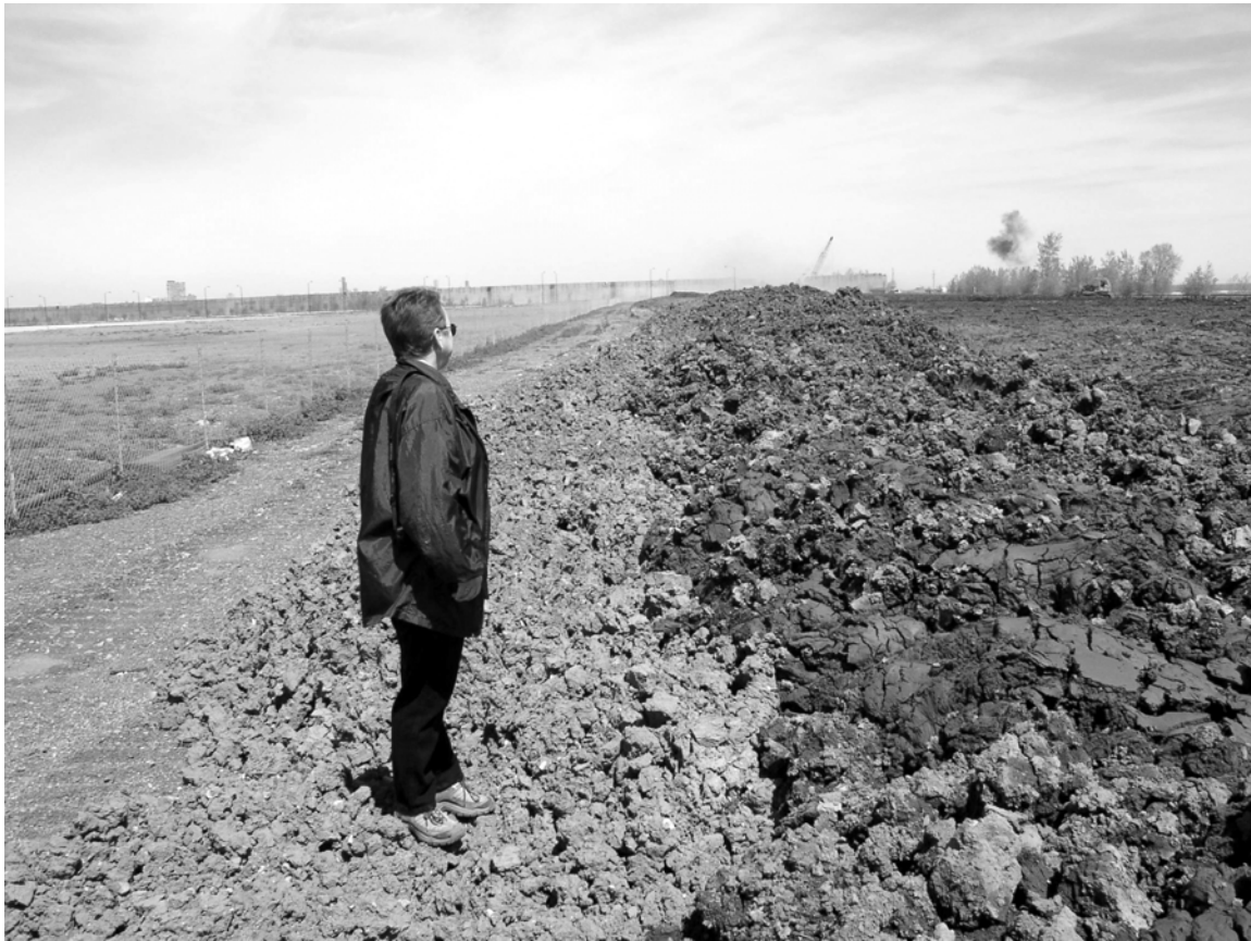
Figure 9. The Chicago Park District’s chief landscape architect stands on a pile of reclaimed topsoil that was pushed up after drying on the slag field for 7 days. A second higher pile is drying in front of her while other material is lying on the field.

During the first five weeks of placing material the temperature ranged from -3 to 27 degrees C ( 27 to 80 degrees F) and it rained several times. A 5 cm (2-in) rain on a Friday left water standing in the tracks through the sediment on the field. By the following Monday the water had evaporated or soaked into the porous slag. Drying was enhanced by wind blowing off the lake. Annual rye grass seed sown by hand on a pile of wet sediment germinated after 10 days. The pushed up piles were hydro seeded with perennial rye grass. By May 17 some of the piled material was breaking up into small peds.