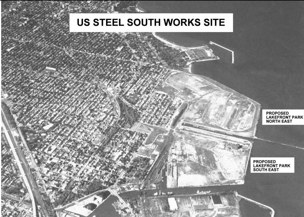
Figure 2. The lakefront edge of the old US Steel South Works site is receiving reclaimed topsoil dredged from Lower Peoria Lake. Barges arrive via the Calumet River in the lower part of the photo and unload in the slip in the center of the site.