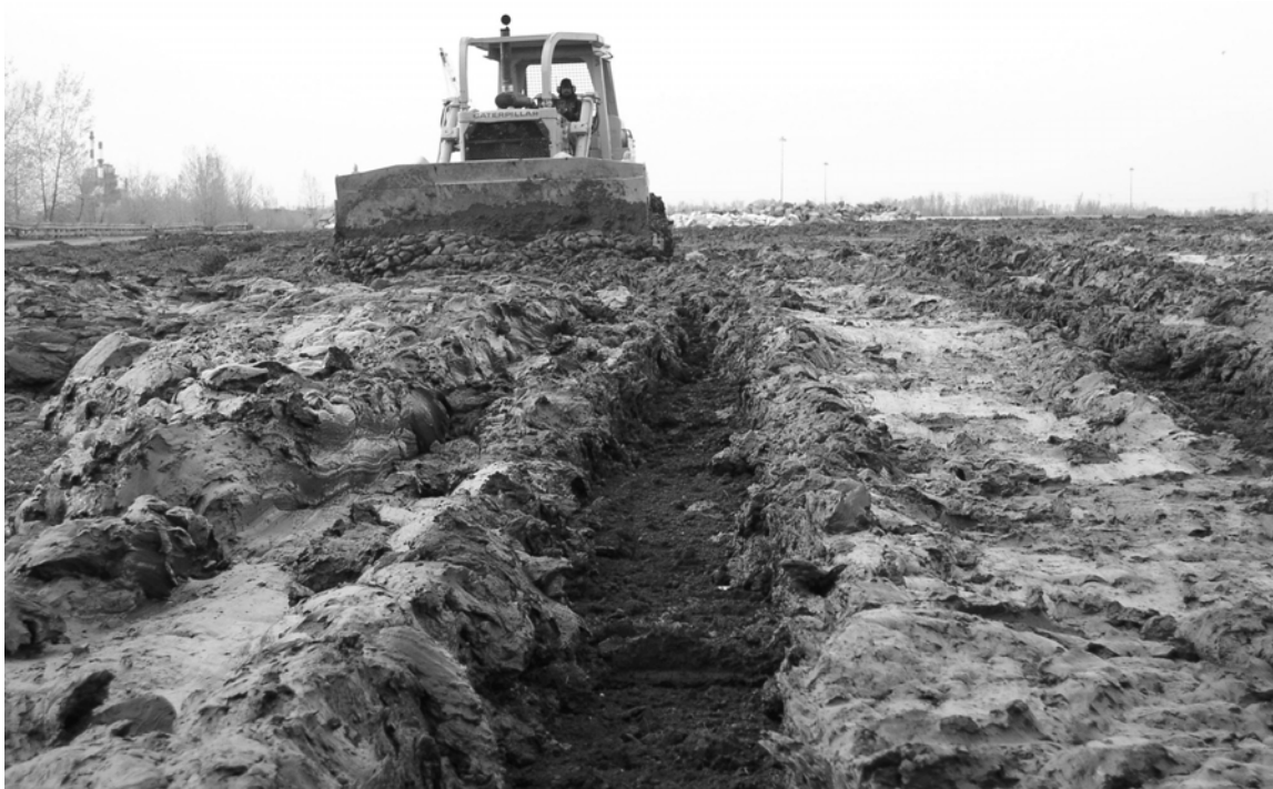
Figure 8. A bulldozer spreads freshly poured sediment into a layer about a foot thick. The tracks expose the porous slag base and leave rows that hasten drying.