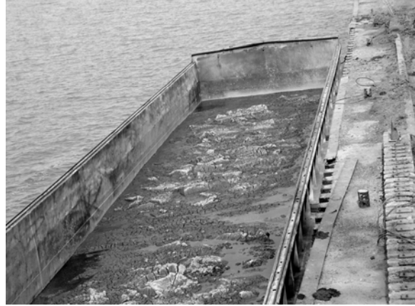
Figure 5. A crust has formed on higher sediment as rainwater fills low spots as barge awaits unloading in Chicago.