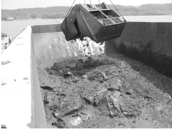
Figure 4. Cable Arm bucket placing high solids sediment in a hopper barge on Lower Peoria Lake.