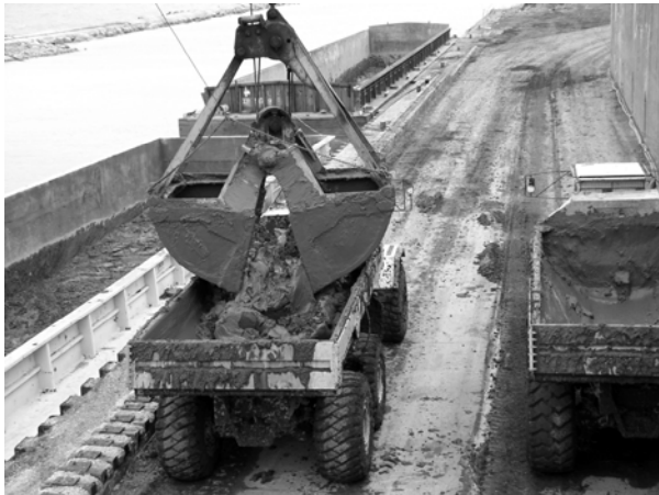
Figure 6. Two bucket loads of sediment fill a mining truck.

After seven days, material placed on the first day was bulldozed into a long pile about four feet high. The dozer took the top 20 to 25 cm (8 to 10 in) of relatively dry material and left the soft, wet bottom layer. The clods in the pile varied from totally dry to moist and comfortably supported a person's weight after a day. The trucks then placed more wet sediment on the bulldozed area. This process continued with the piles growing to six feet high over the next two weeks. As space grew more limited on the initial site, material was bulldozed while wetter and piled deeper prior to moving the equipment to the northern fields. The contractor will place more material on the southern area after the sediment there has had time to dry and be pushed into piles (Figure 9).