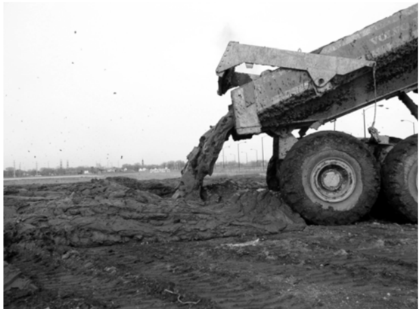
Figure 7. Wet sediment pours onto a slag field destined to be a park.