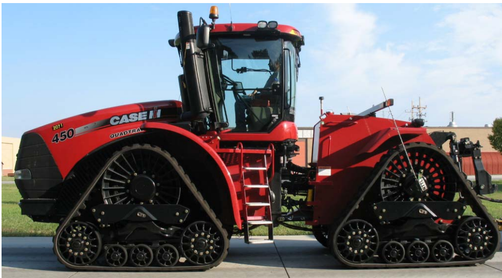
CASE IH Steiger Rowtrac 450 Diesel